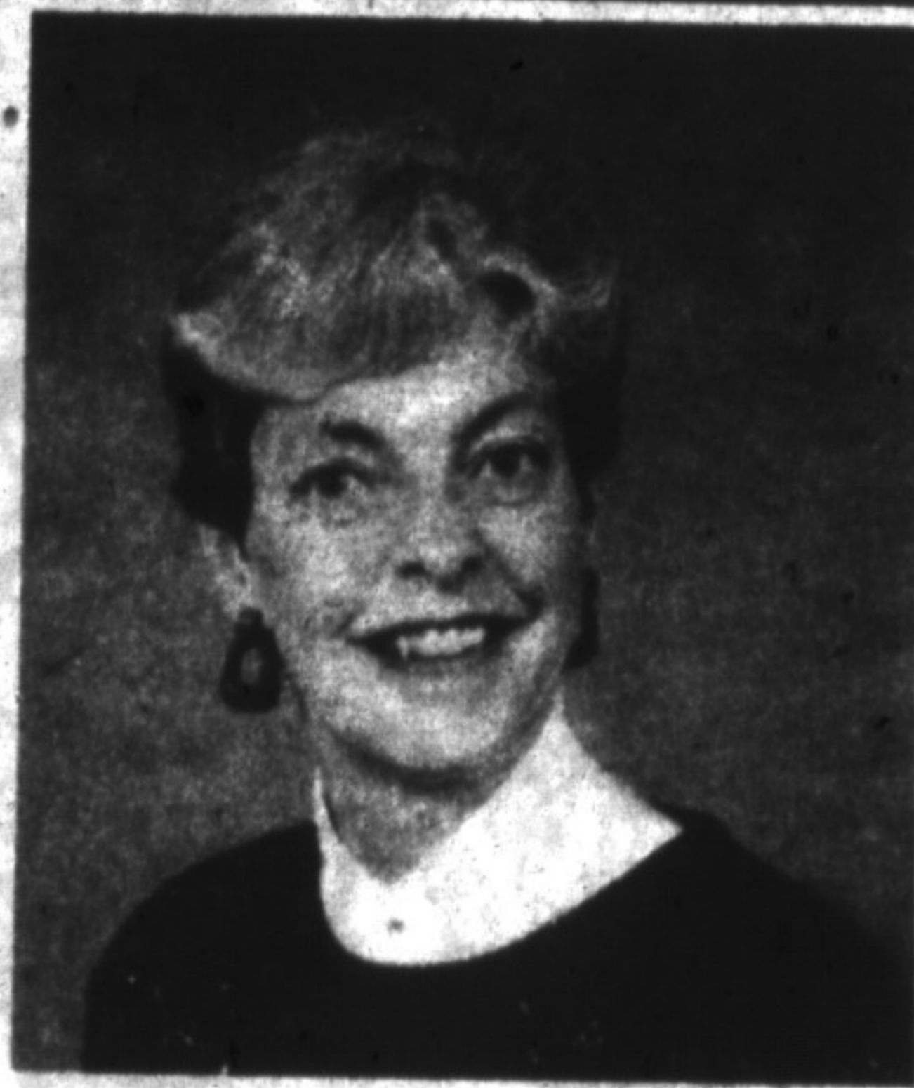
CAROLE D. BUDWORTH

3 bedrooms, 3 bathrooms, large eat-in kitchen, separate dining room, large living room with walkout to patio. Loaded with upgrades. This beauty is a must on your shopping list. Now $125,000.