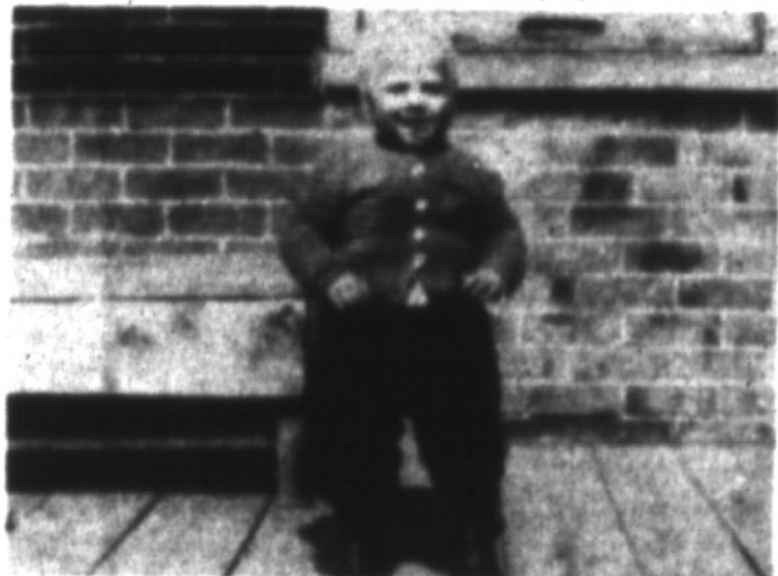
LOVE FROM JUNE, COUSIN IT & THE GANG!