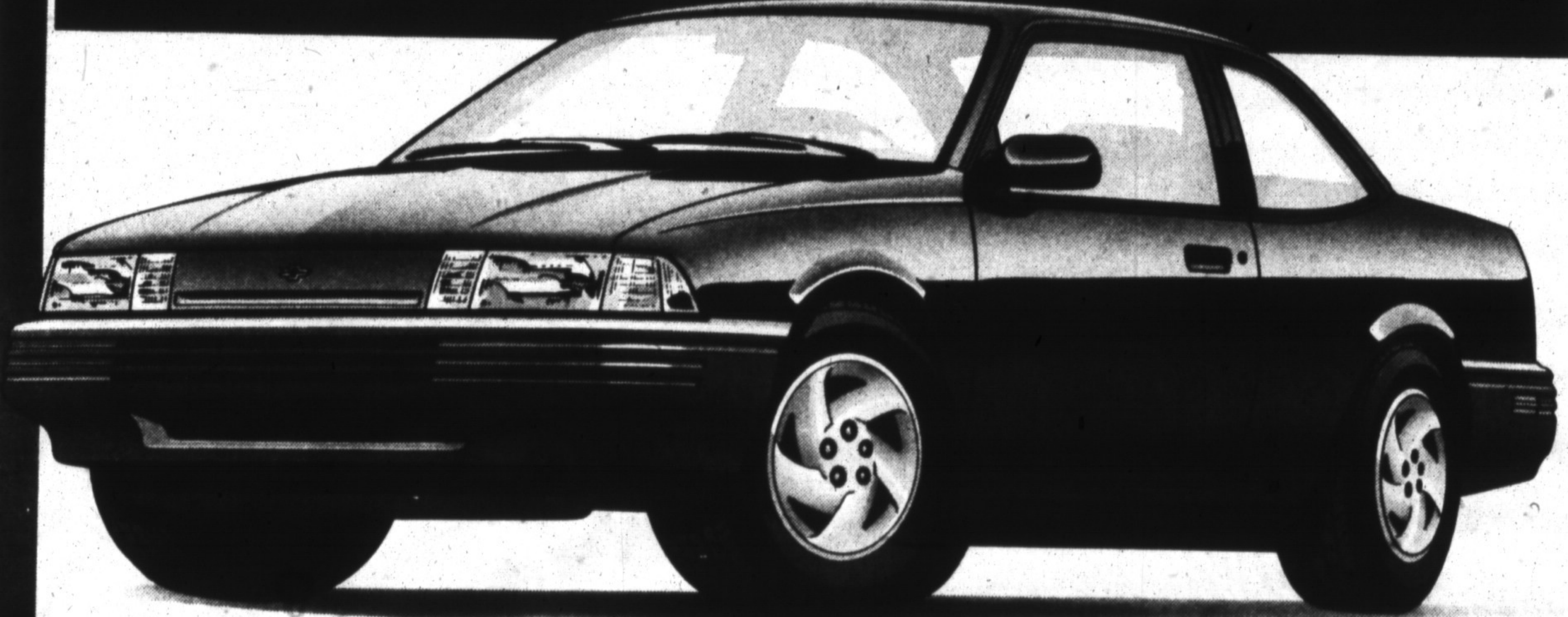
1993 Chevy Cavalier VL

CHEVY CAVALIER $4,600 LESS THAN COROLLA. NO WONDER IT'S CANADA'S BEST SELLING CAR.