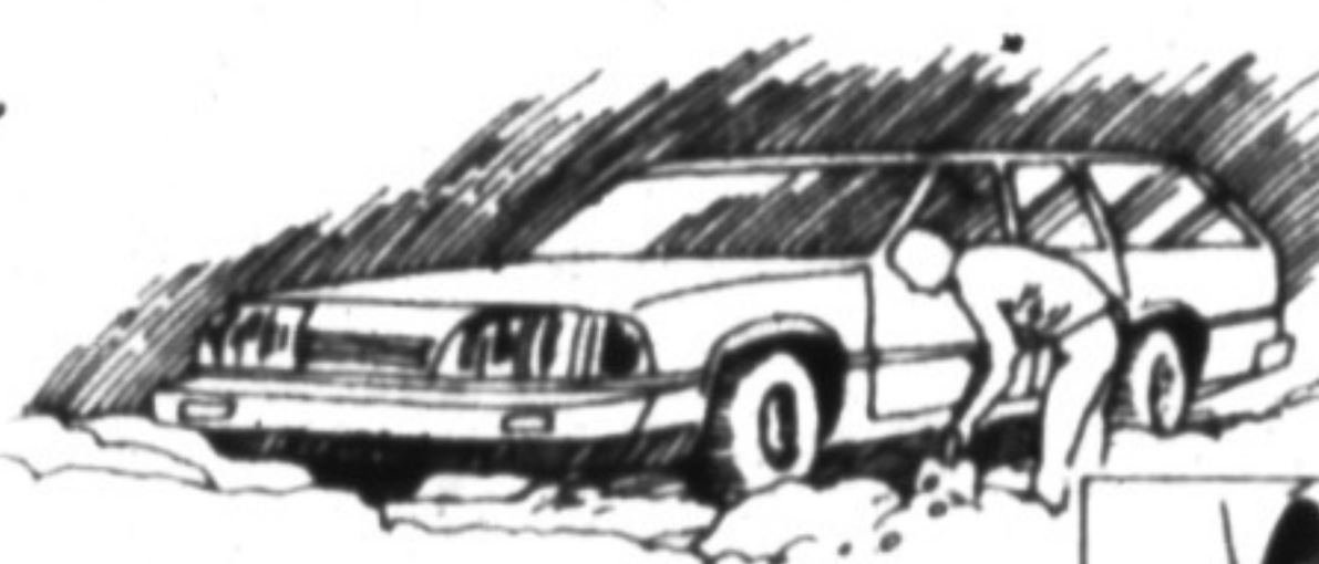
Remove snow from around wheels