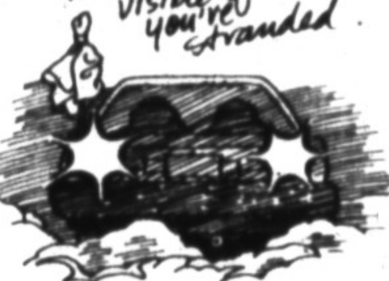
Make car visible if you're stranded

If you are stranded try to make the vehicle as visible as possible, using flares, emergency flashers or even a scarf or piece of cloth tied to the aerial.