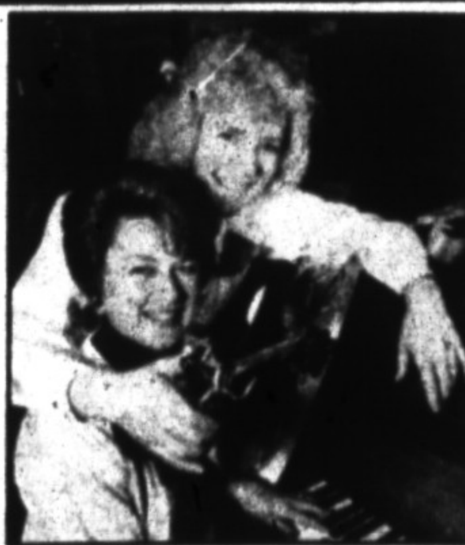
See Page 11