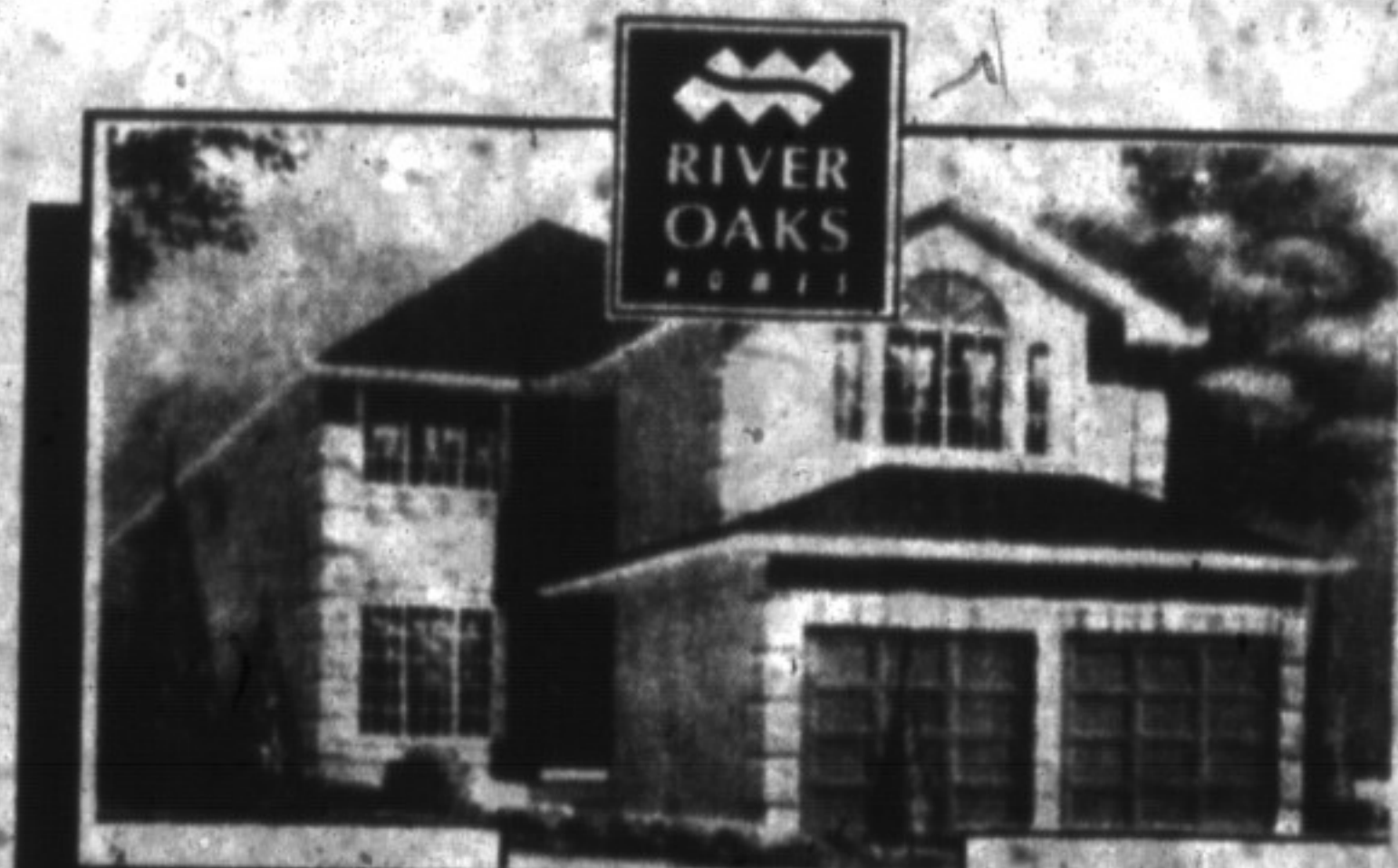
ALL BRICK MODEL 44 FROM 227,900