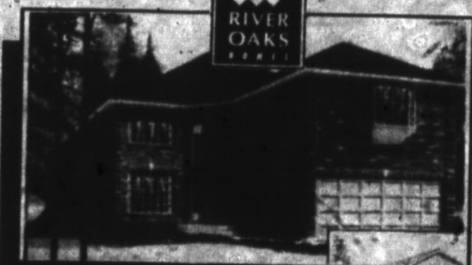
ALL BRICK MODEL 47 FROM 239,900