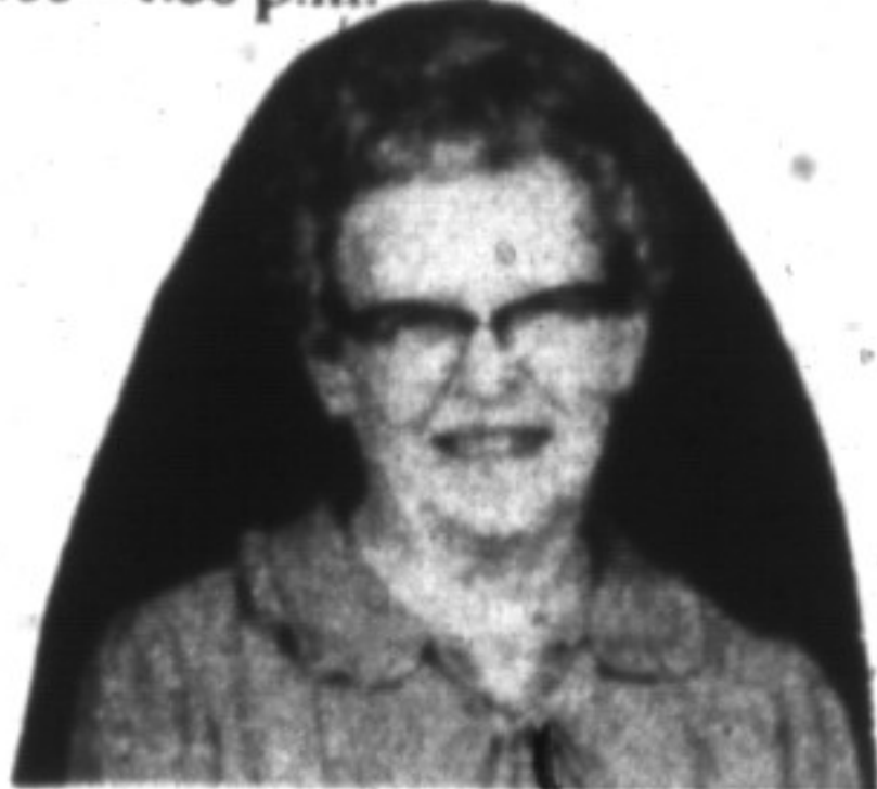
Best Wishes Only

Cordially invite family, friends and neighbours to celebrate Mom's 90th birthday. An Open House will be held on Sunday, November 15th, 1992 at Club 88, The Canadian Legion on Charles Street, Milton from 2:00 - 4:00 p.m.