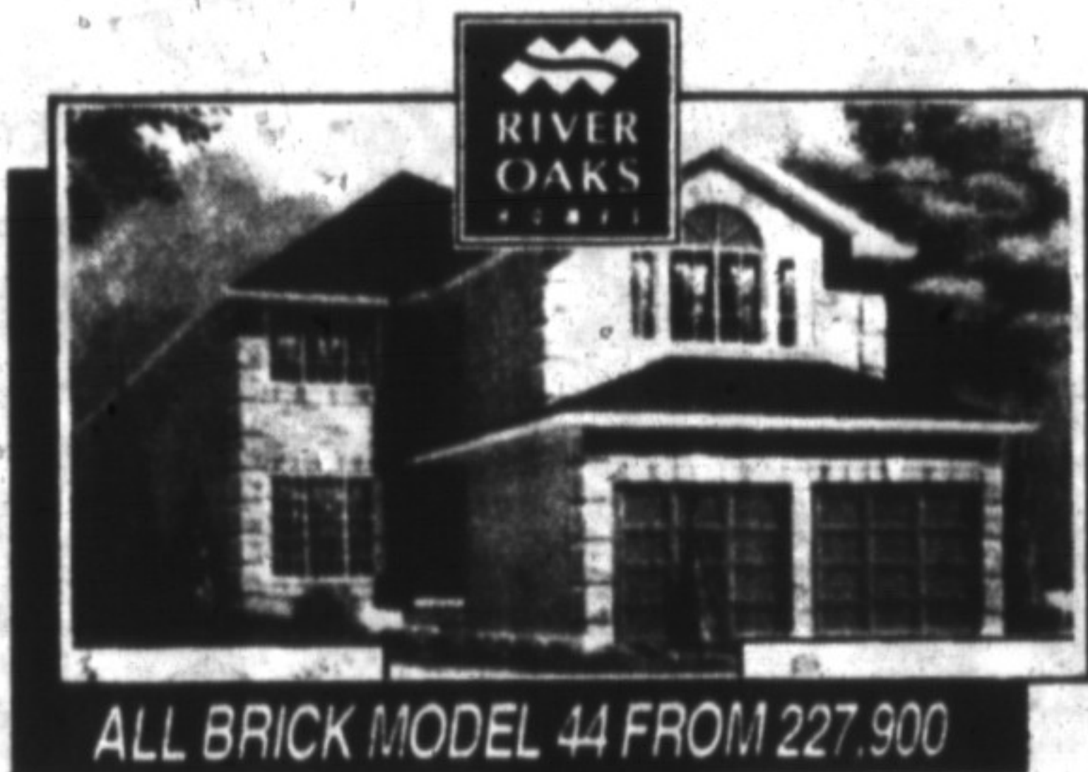
ALL BRICK MODEL 44 FROM 227,900