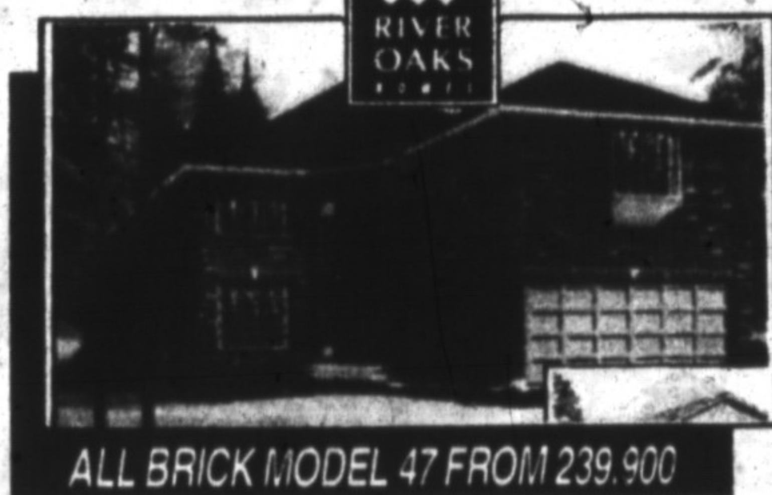
ALL BRICK MODEL 47 FROM 239,900