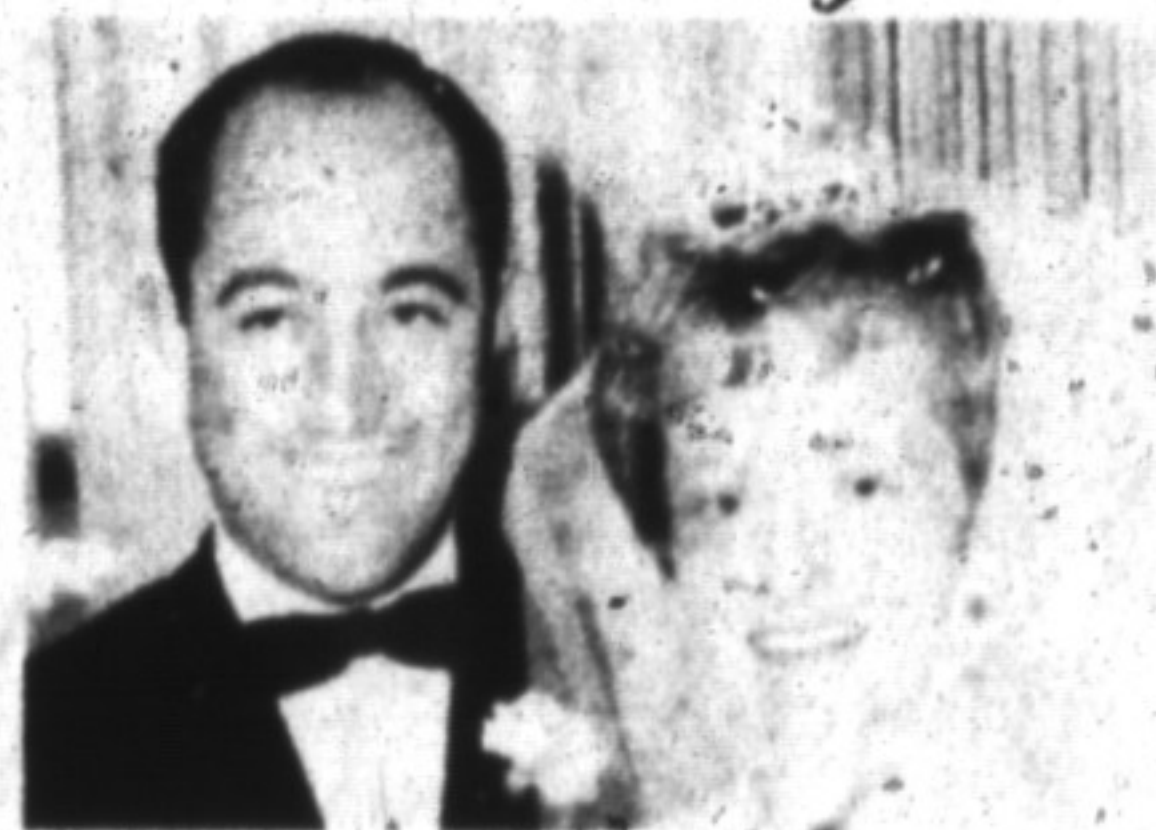
Love and Best Wishes from Family & Friends