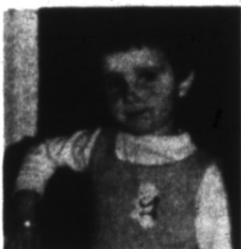
With love from all family including friends

Now you see our wife, mother, daughter and friend at 3 years of age. Next week at 30 years of age.