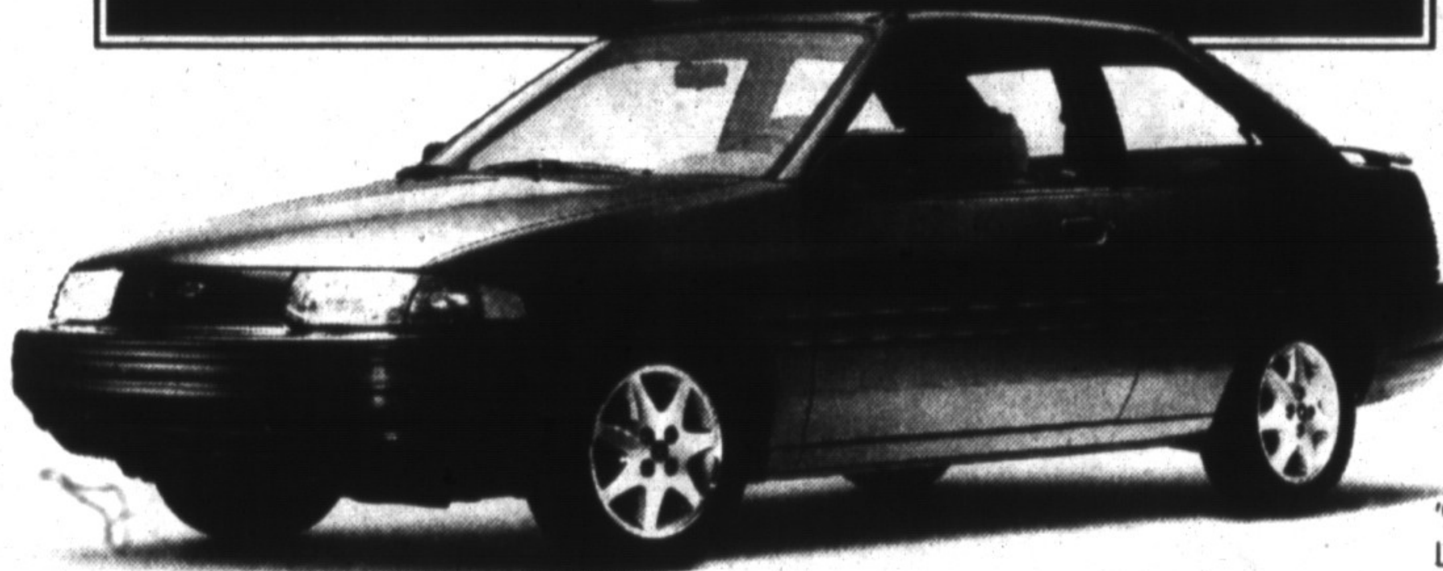
'93 ESCORT LX SPORT WITH AIR