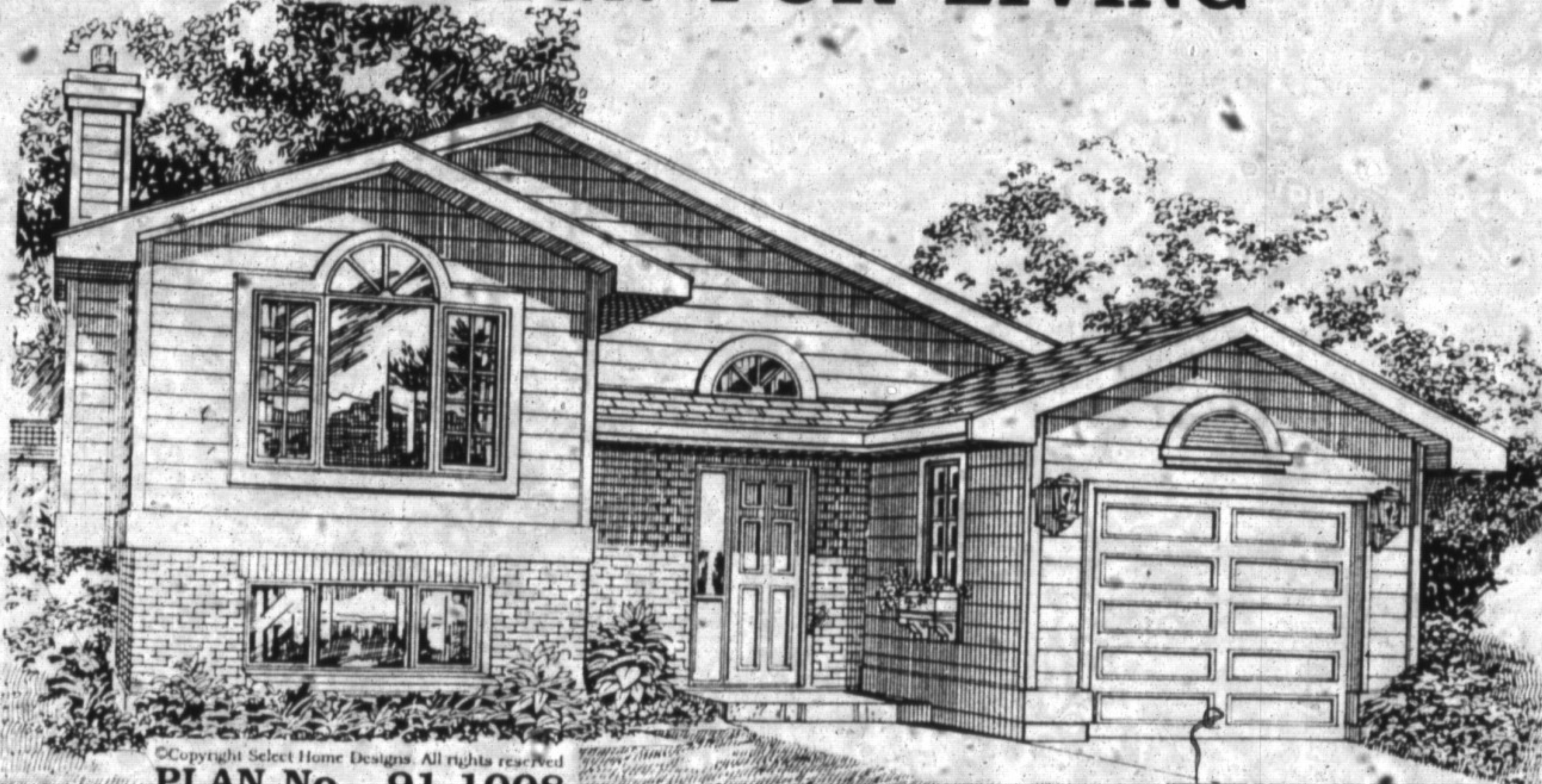
PLAN No. 91-1008