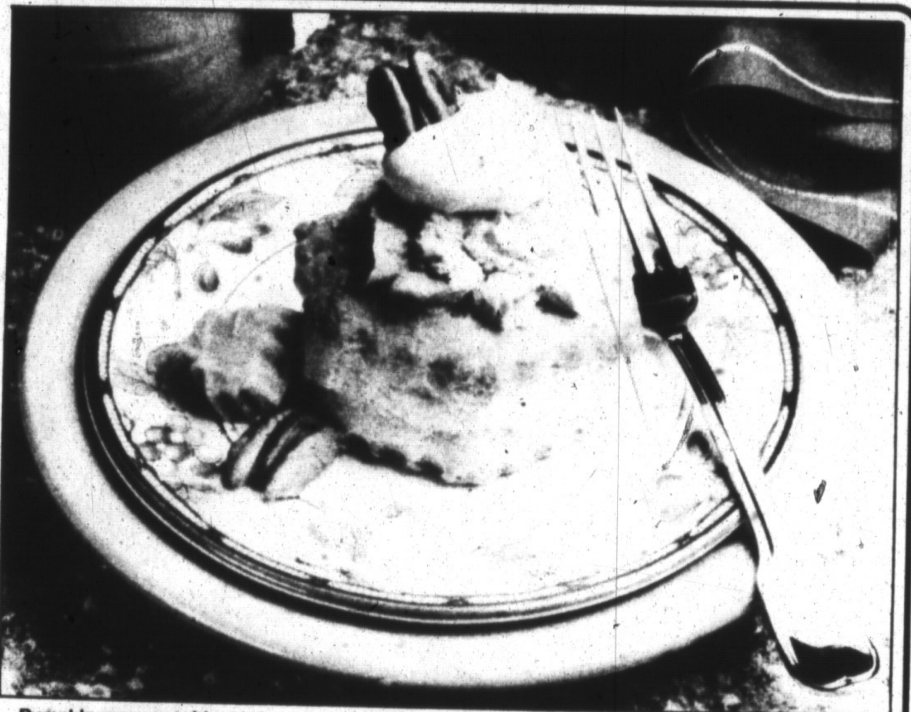
Pumpkin mousse with maple cream served in puff pastry shells gives a new twist to pumpkin pie.

Directions: Prepare patty shells according to package directions. Cool. Combine pumpkin, 1/3 cup (75 ml) brown sugar, ginger, clove and rum. In medium bowl, beat 1/2 cup (125 ml) cream until stiff; fold in pumpkin mixture. Spoon into patty shells. Chill at least 4 hour. Beat remaining cream, brown sugar and maple extract until stiff. Chill. Spoon on top of pumpkin mousse. Garnish with pecans or shaved chocolate, if desired. Makes 6 servings.