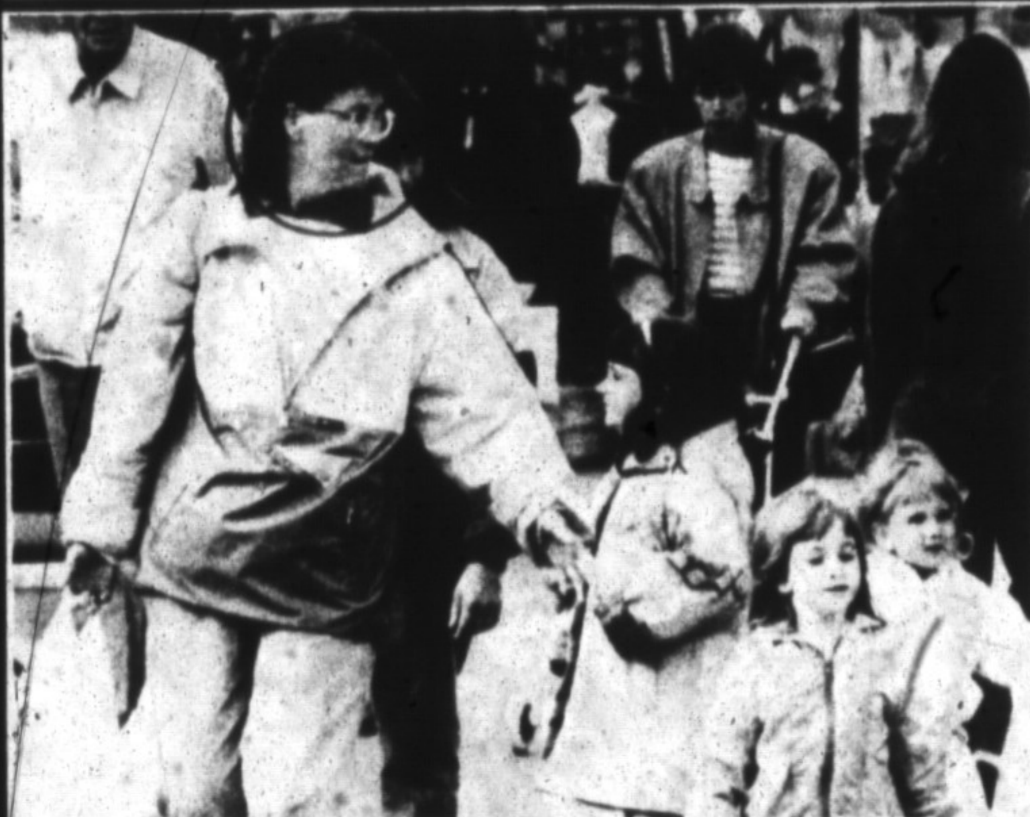
"DOWNTOWN SHOPPER" Please call 876-2773 to Win!

A DOWNTOWN MILTON WEEKLY REPORT ON COMMUNITY NEWS, VIEWS & HAPPENINGS