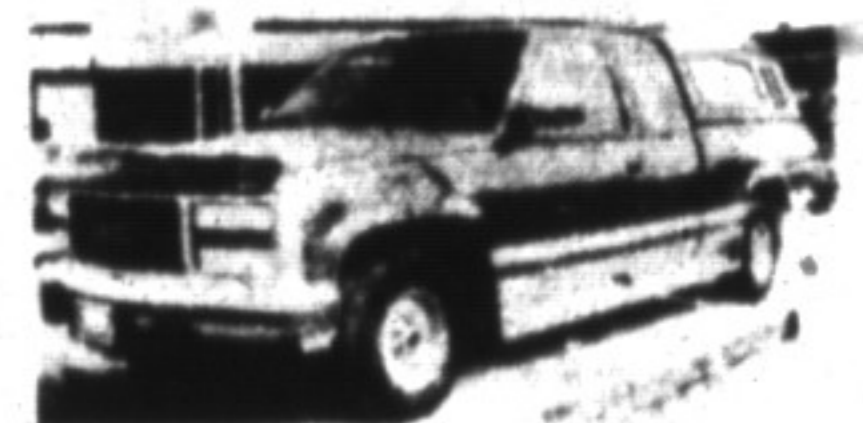
1990 GMC SLE EXTENDED CAB 1/2 TON

Only 47,000 km!! Local one owner, top of the line model, fully loaded incl. cap, balance of GM Warranty