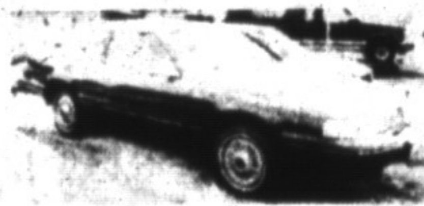
1988 MERCURY COUGLAR LS

Only 55,000 km!! Local one owner, V8 engine, every conceivable option including power seats, wire wheel discs. Has Ford ESP extended warranty until May 28/94 or 100,000 km.