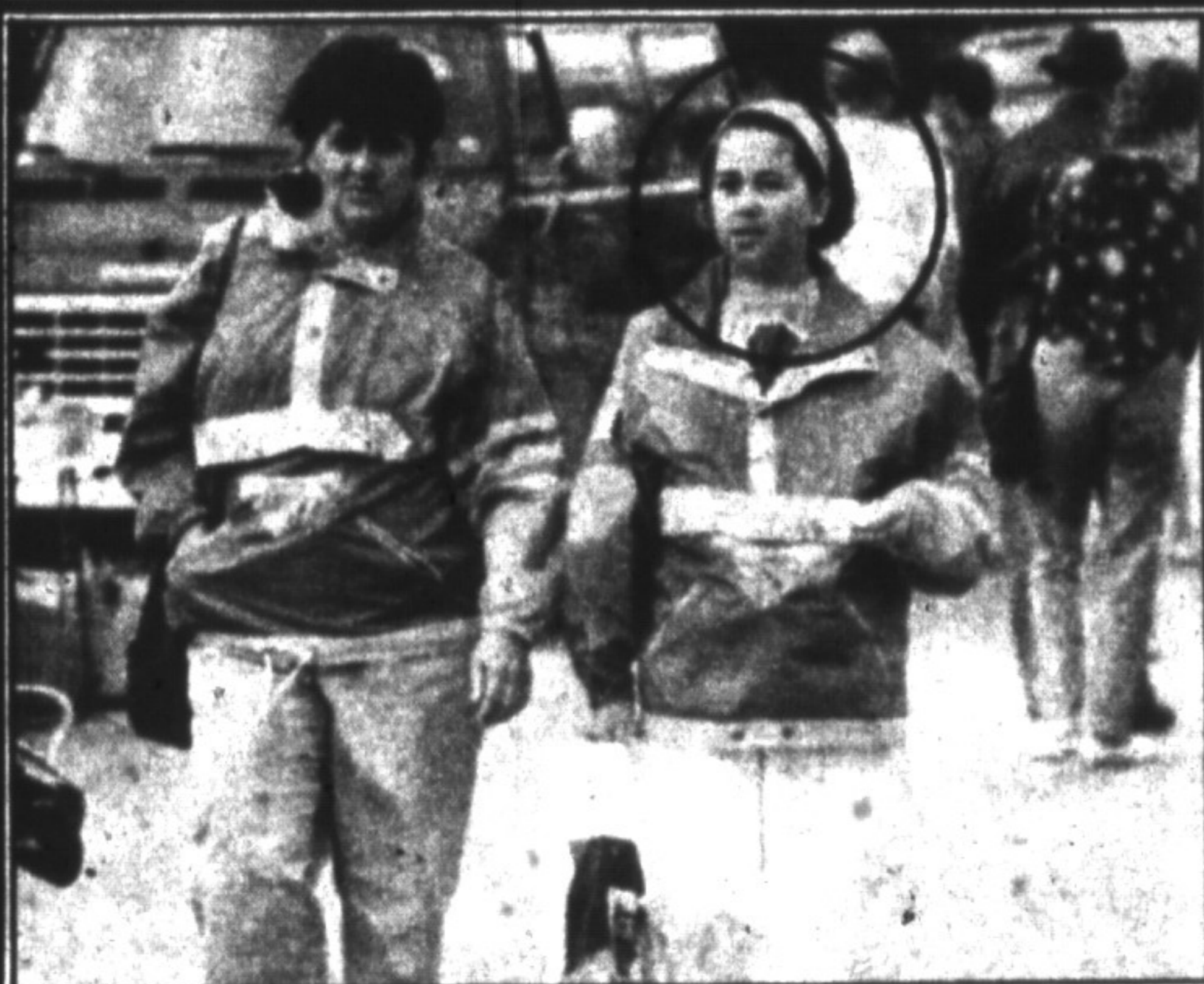
"DOWNTOWN SHOPPER" Please call 876-2773 to Win!

A DOWNTOWN MILTON WEEKLY REPORT ON COMMUNITY NEWS, VIEWS & HAPPENINGS