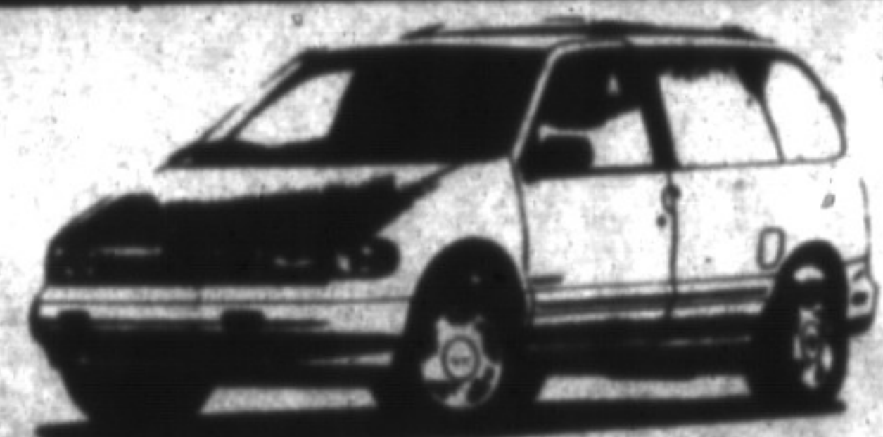
1993 QUEST GXE

An all new entry in the compact sedan segment, Altima is targeted at the heartland of Canadian car buyers. It will appeal not only to the traditional "Marrieds with children" but also singles and empty nesters, who are also well represented in the segment. To this end Altima offers a new level of styling "elegance & thoughtfulness" not commonly seen in compact sedans.