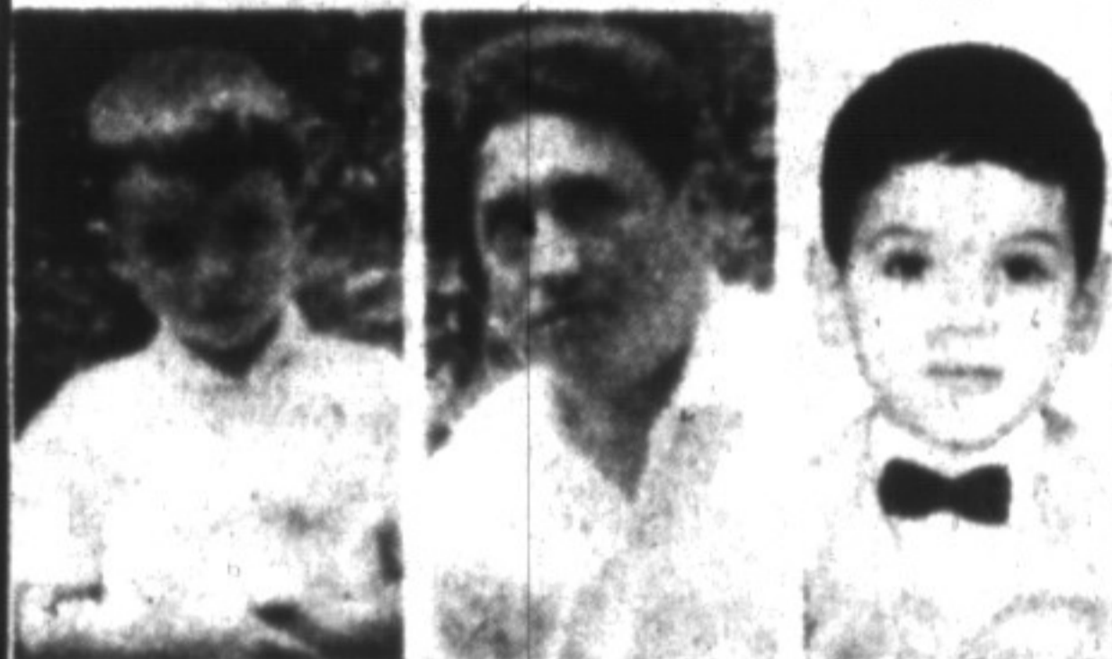
LOVE: FAMILY & FRIENDS