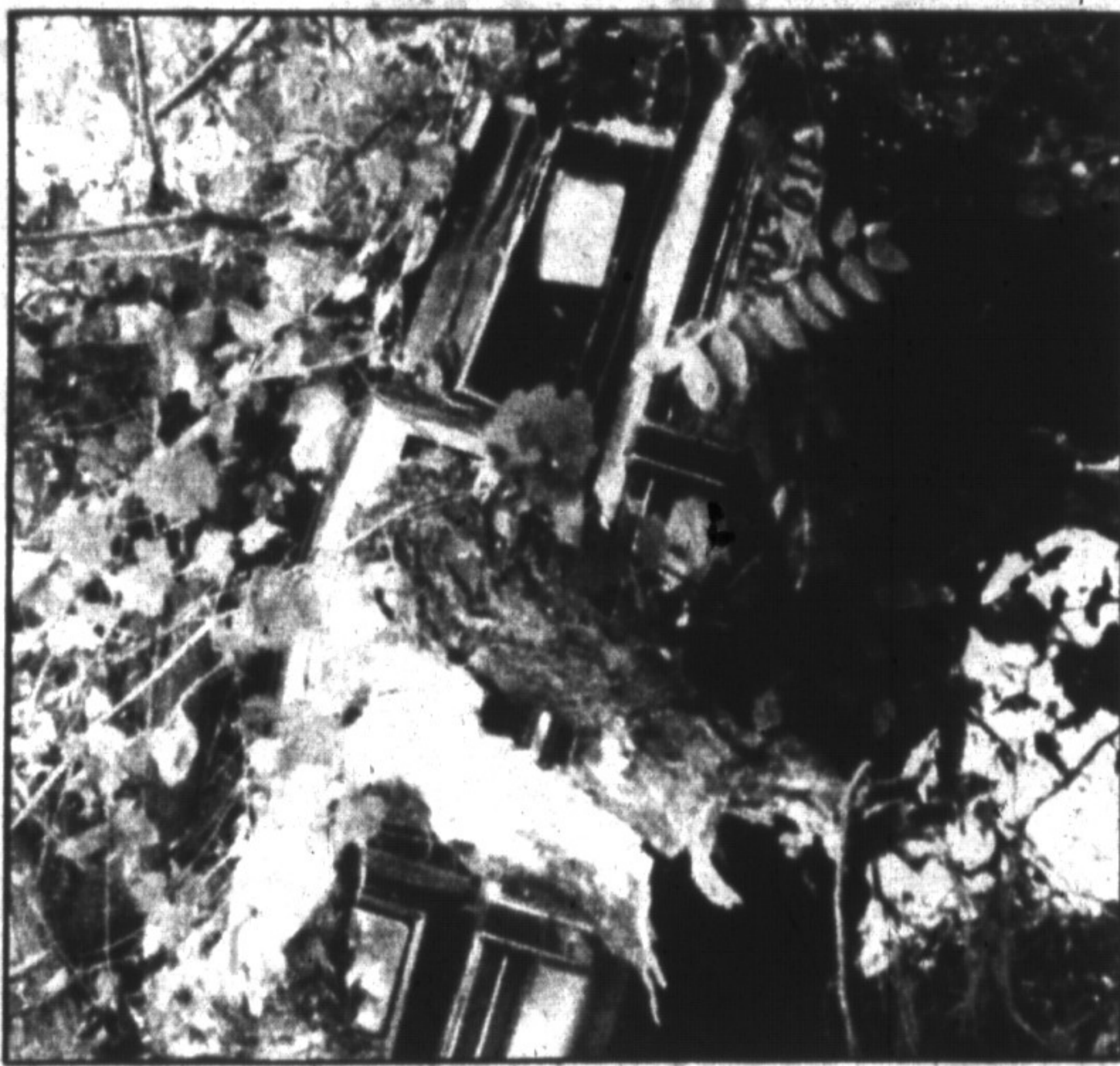
This red Lincoln Town Car was hidden under the trees after the driver lost control and drove into the ditch on No. 10 Sideroad Thursday.

"I thought the tree was down," he recalled. "I went right by and I didn't see the car there. Then I looked back and saw the car and I stopped. They were trapped inside and I helped them get out."