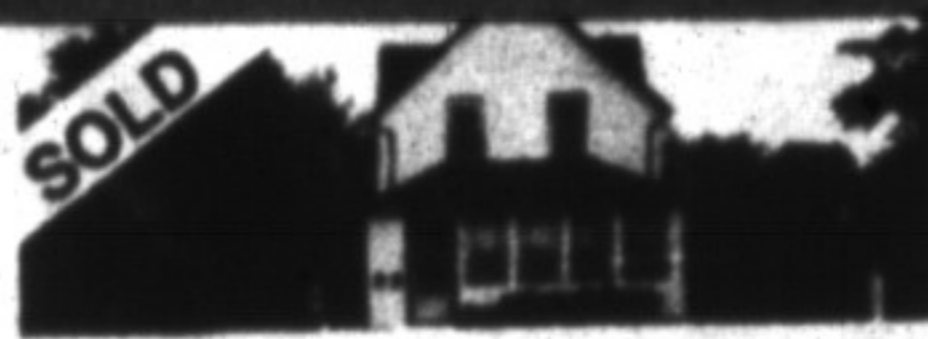
GRANDMA'S HOUSE IS SOLD!