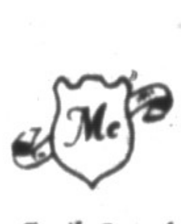
Family Owned Funeral Home