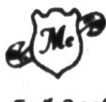
Family Owned Funeral Home