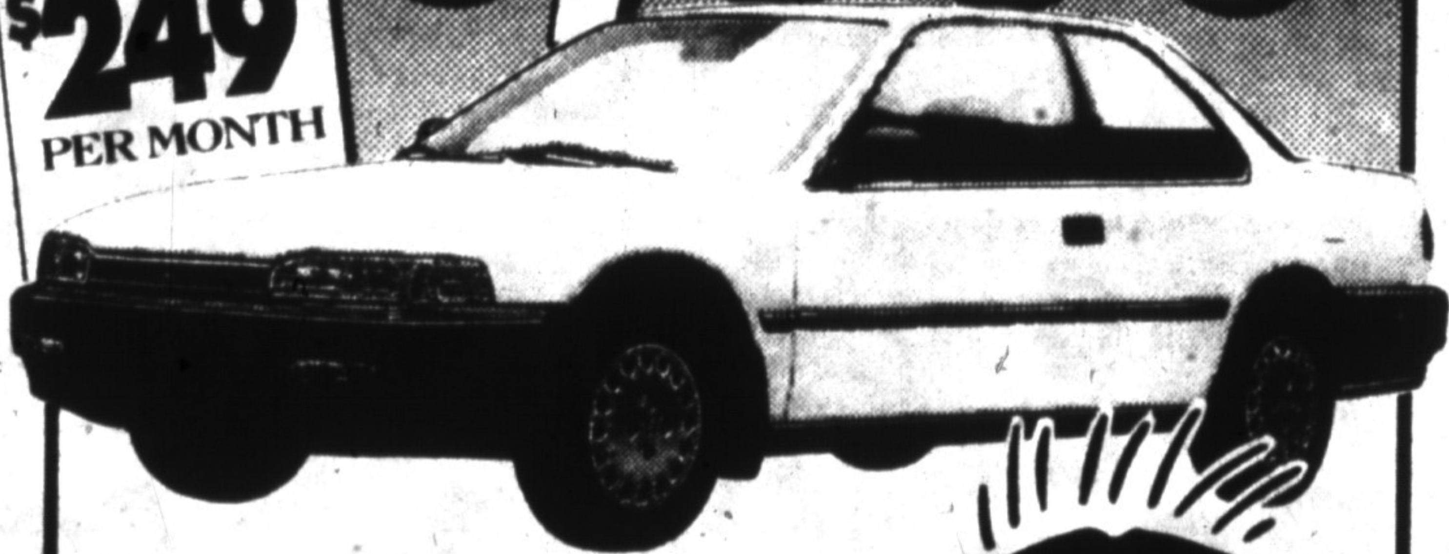
Accord LX Coupe 5-Speed