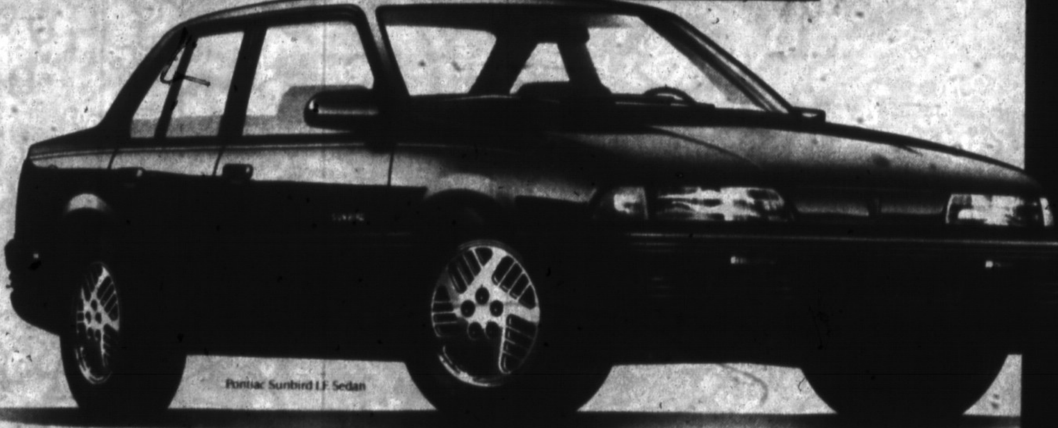
Pontiac Sunbird 1.6 Sedan

with $750 cashback and no charge air conditioning applied