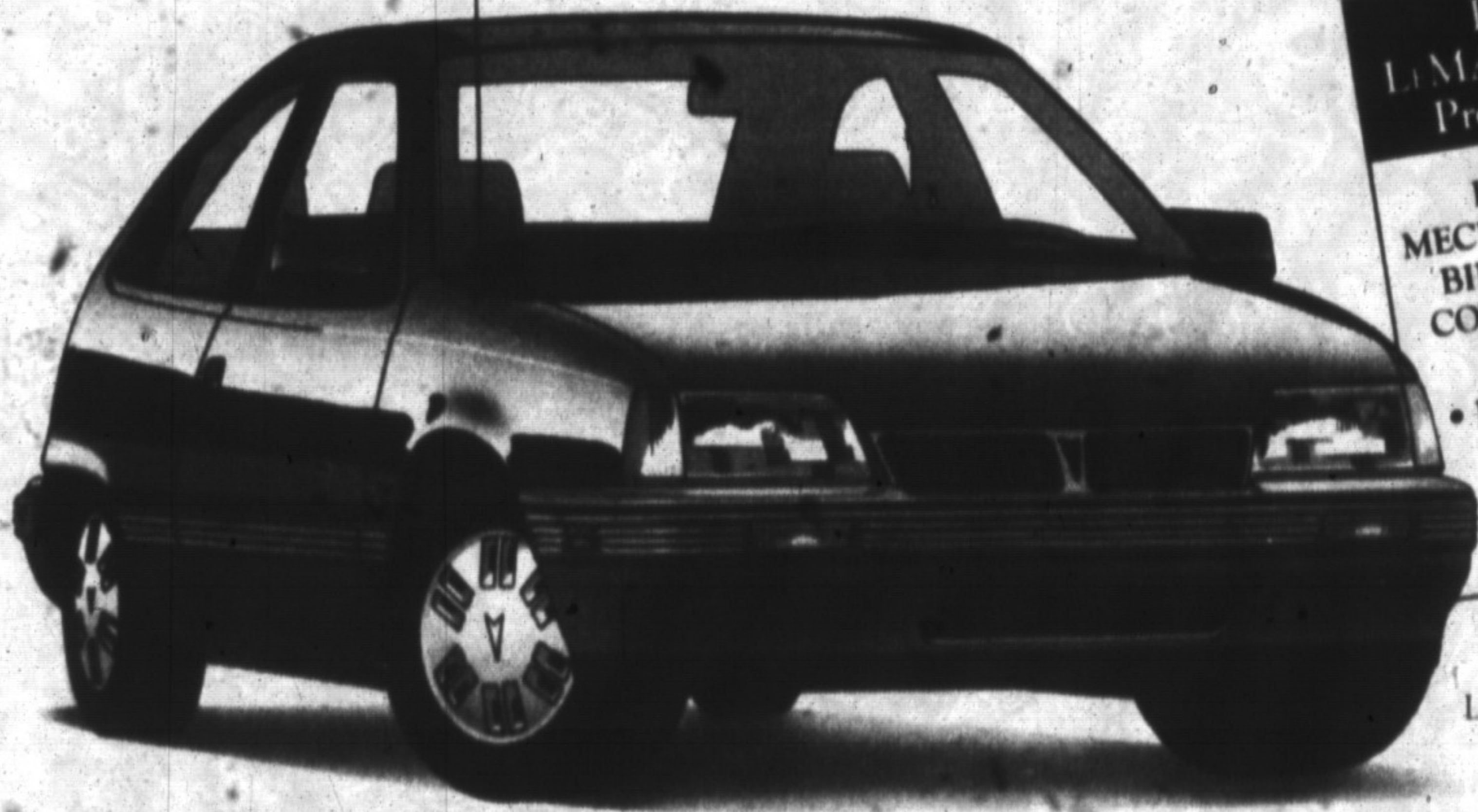
Le Mans VL Aerocoupe

For only $155 a month,* LeMans by Pontiac gives you the freedom to go where you want this summer.