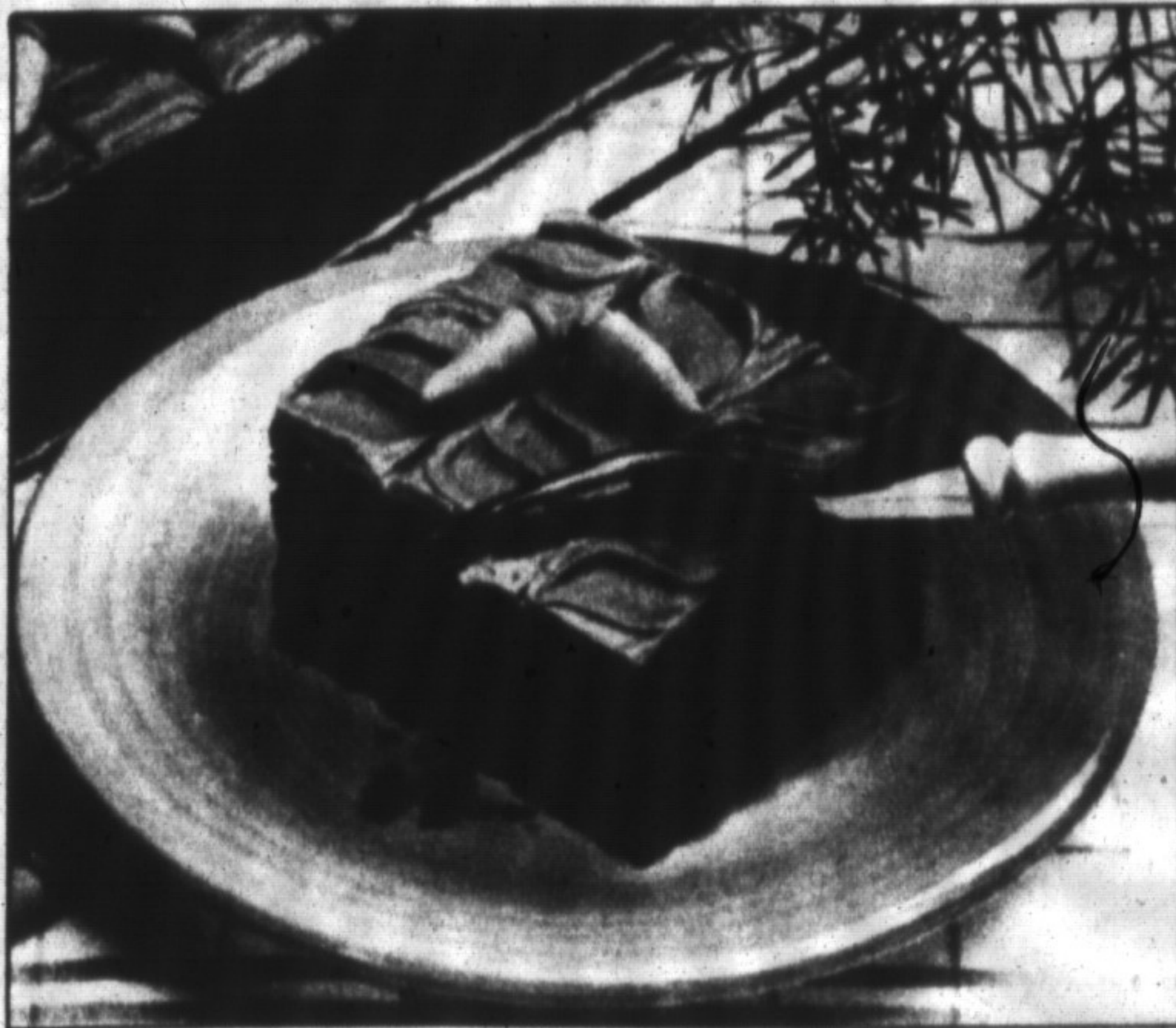
It's unlikely any chocolate lover could resist Chocolate Carrot Cake.

Directions: In a large bowl, stir together flour, sugar, cocoa, baking soda, cinnamon and salt. In small bowl, beat eggs until light; stir in oil and apple sauce. Add egg mixture, carrots and walnuts to flour mixture.