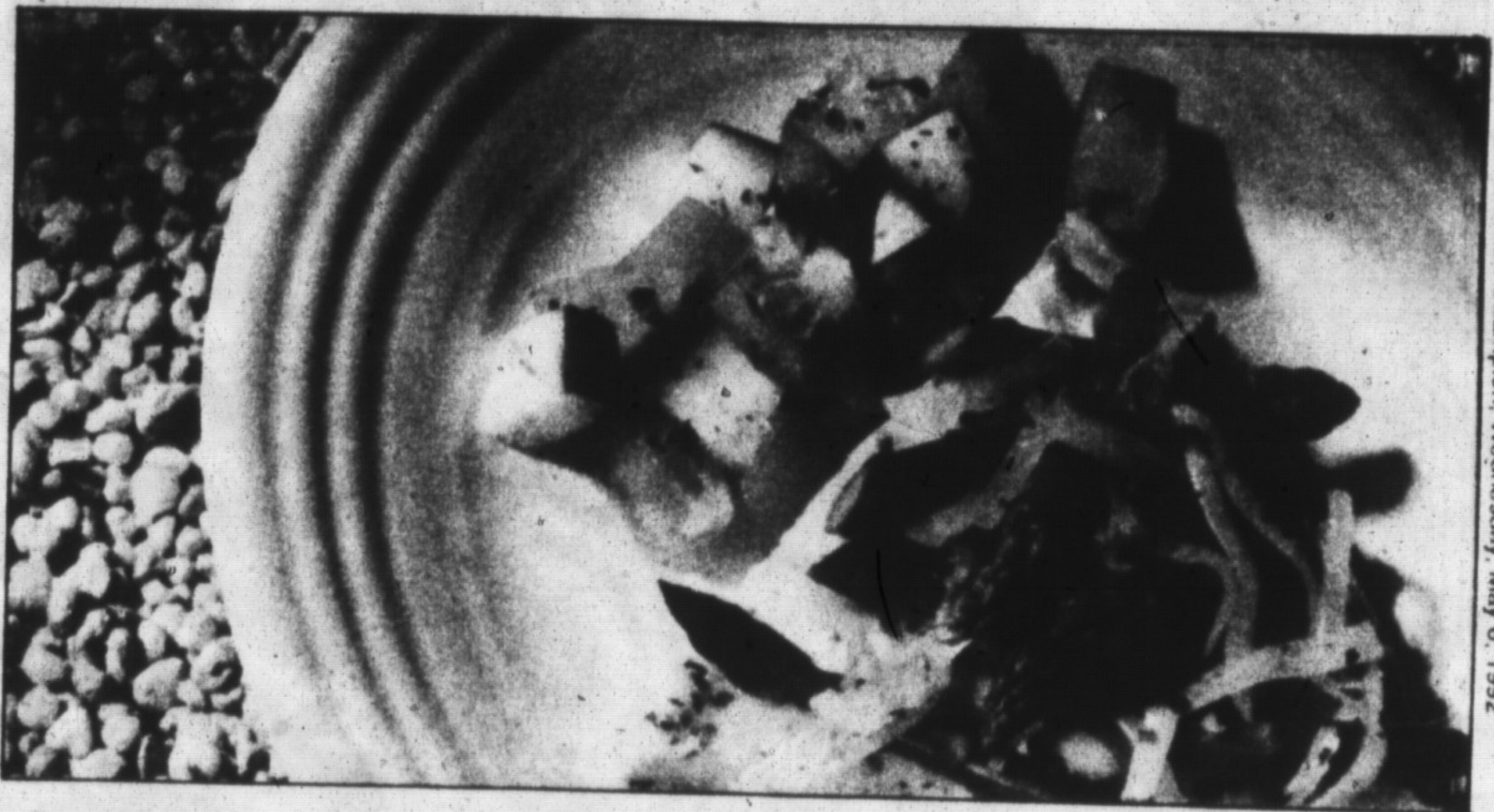
From mid-May to June, dinner couldn't be easier or fresher with an Ontario Asparagus Frittata — an open-faced omelette loaded with delicate green spears topped with cheese and on the table in under half an hour.

Place bread on a baking sheet, arrange asparagus on bread and pour equal quantities of cheese sauce on each slice. Bake in 350F (180C) oven for 10 to 15 mins. or until bottom of bread is slightly toasted and cheese sauce is golden brown on top. Serves 6 to 8 people.