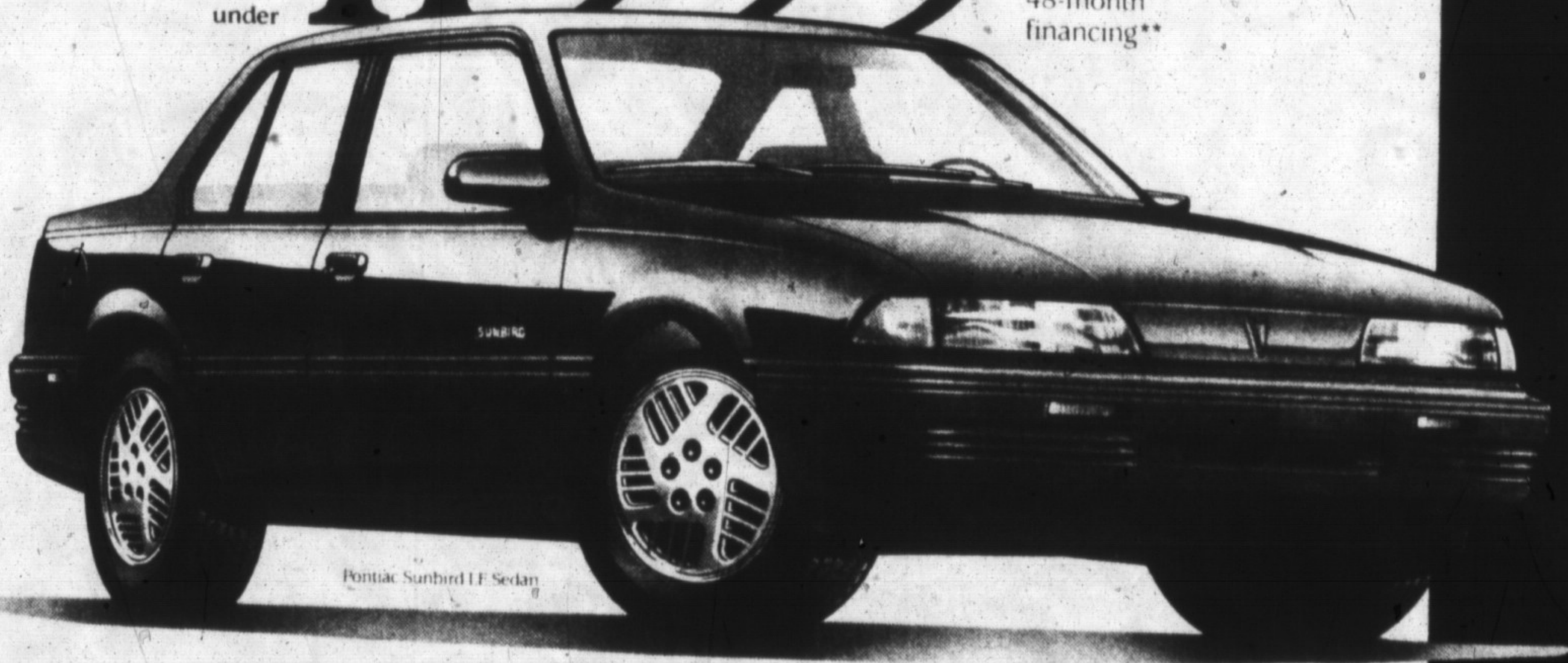
Pontiac Sunbird 1.6 Sedan

with $1,000 cashback applied or choose 7.9% 48-month financing**