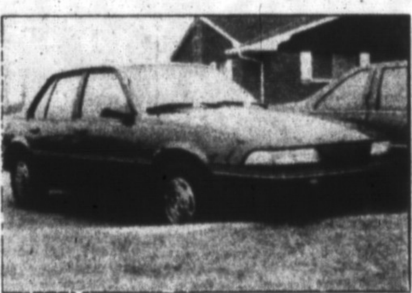
'89 PONTIAC SUNBIRD Blue metallic, air, Stereo Cass. Auto trans, low km. Stk# 1048C-1 $7,195