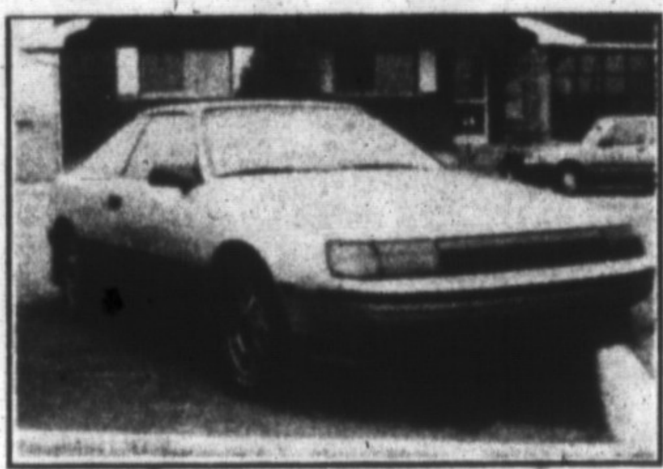
'86 CELICA GT Two Tone blue, 4 spd, auto overdrive, alum wheels Stk# 2093-1 $7,295