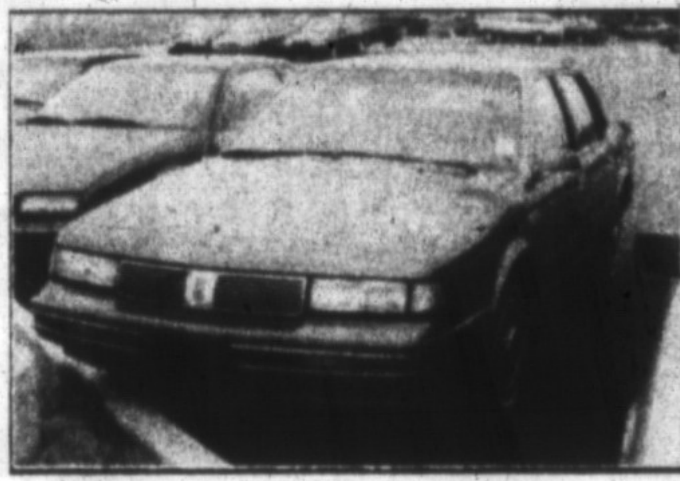
'87 OLDS CIERRA BROUGHAM Air, V6, great family car, AM/FM Stereo Stk# 1017-1 $6,995