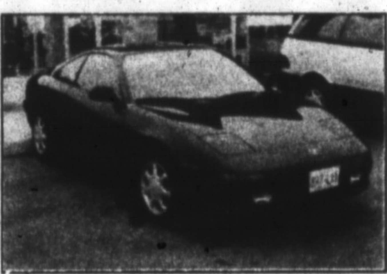
'91 TOYOTA MR2 Demo Metallic red, T bar roof, Air, Cruise control, AM/FM, Stereo cass., tilt wheel, 17,5000 km JUST IN TIME FOR SUMMER Stk# 1207 $19,995