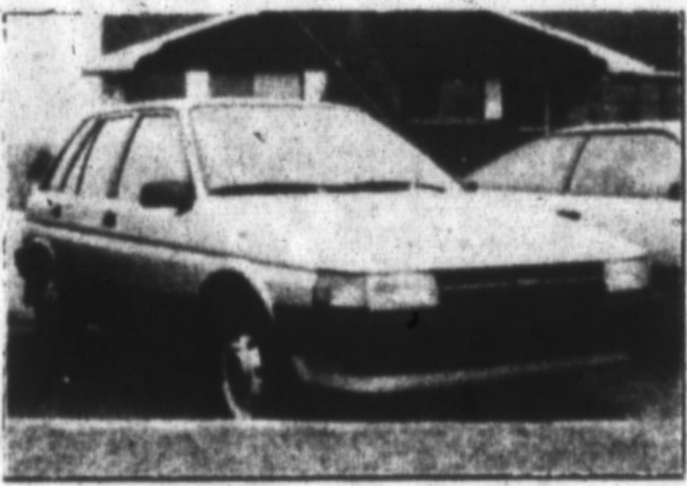
'88 TOYOTA TERCEL 5 or Hatch back, AM/FM Stereo, 5 spd. trans. Must be seen Stk# 4226-1 $5,995