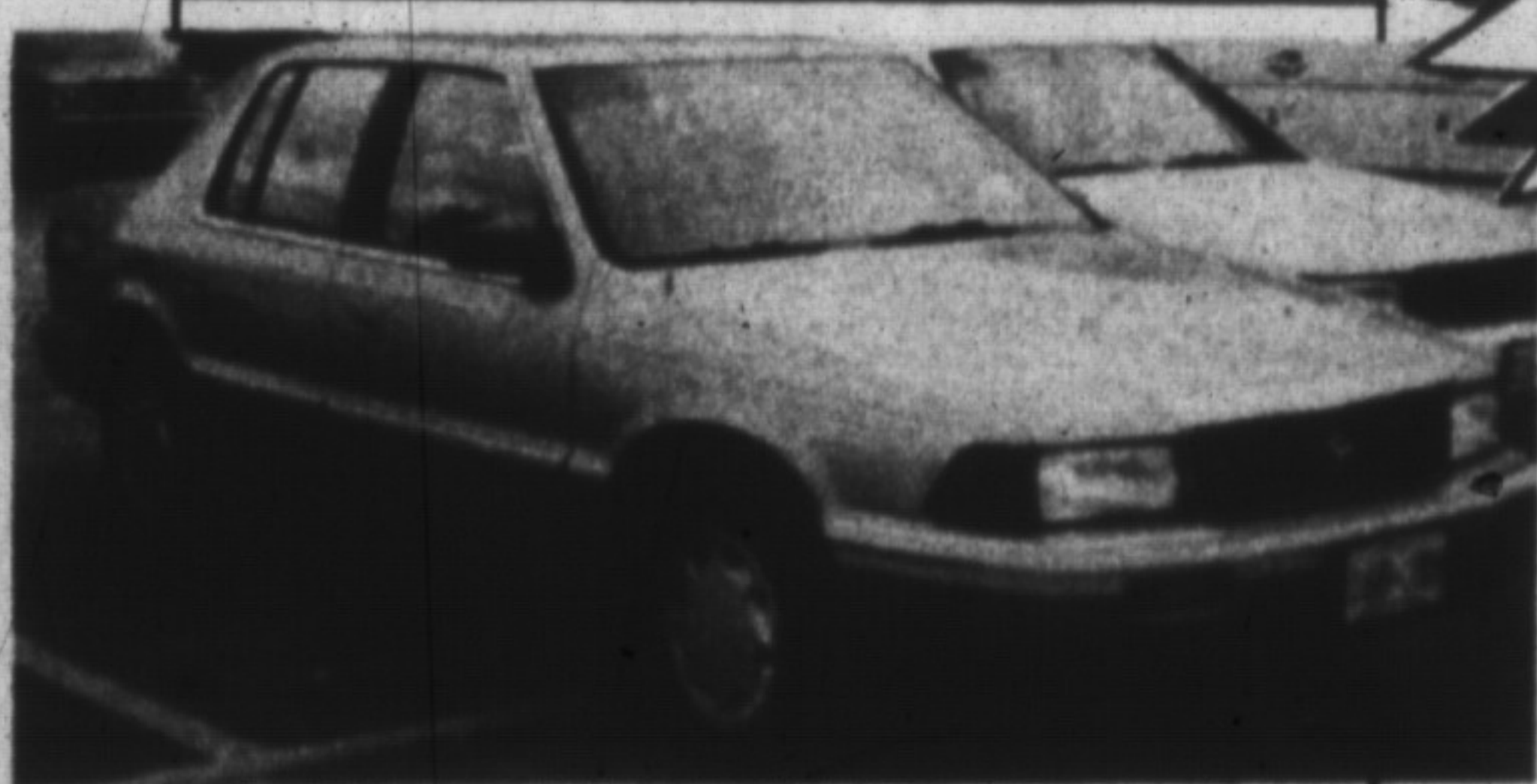
1991 PLYMOUTH ACCLAIM Air, gold *11,595

BALANCE OF 7 YEAR OR 115,000 KM POWER TRAIN WARRANTY