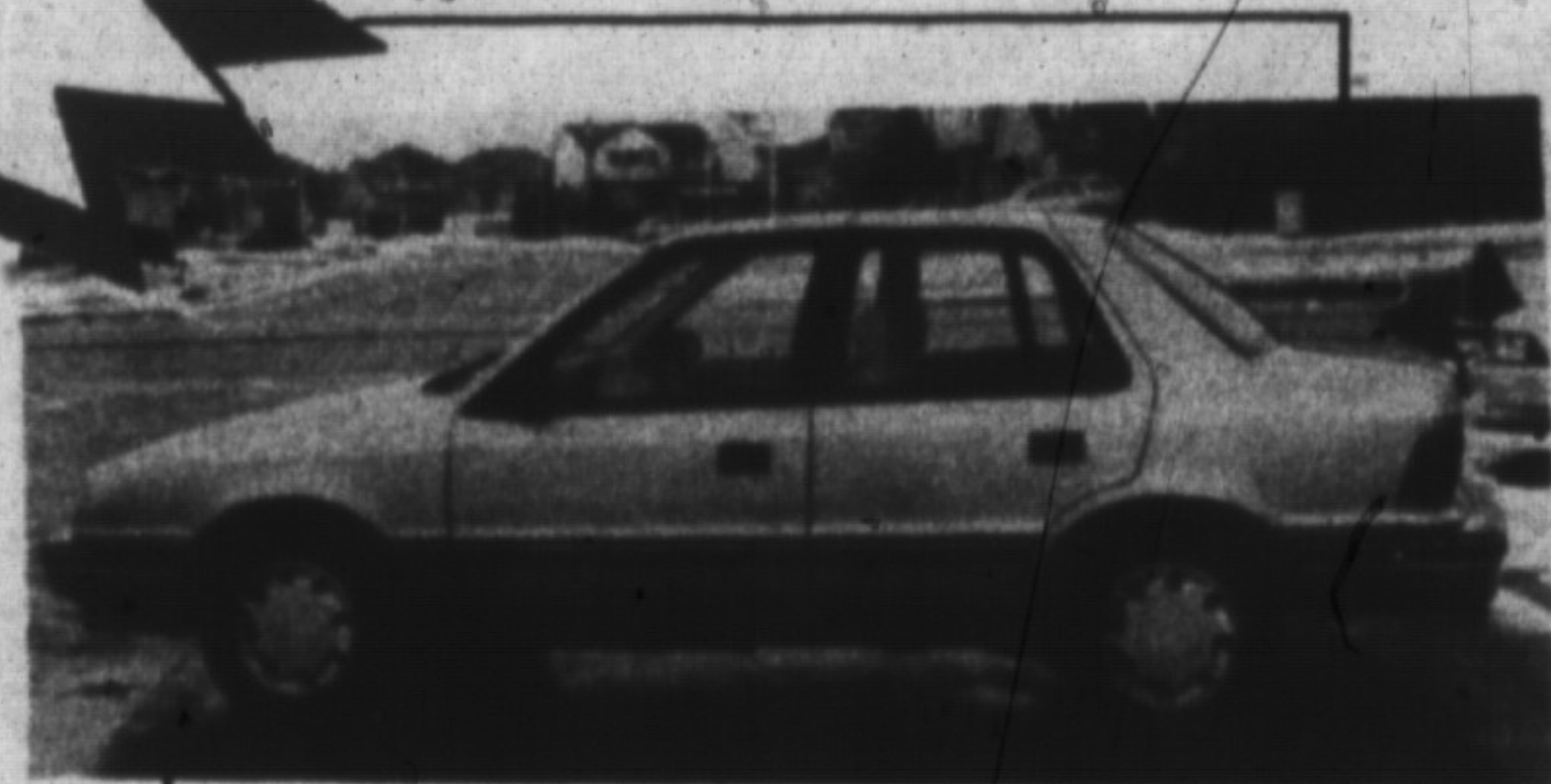
1990 PLYMOUTH SUNDANCE Air, gold *8,495

• WE WANT YOUR BUSINESS — WE HONOUR ALL CHRYSLER, PLYMOUTH AND DODGE WARRANTIES