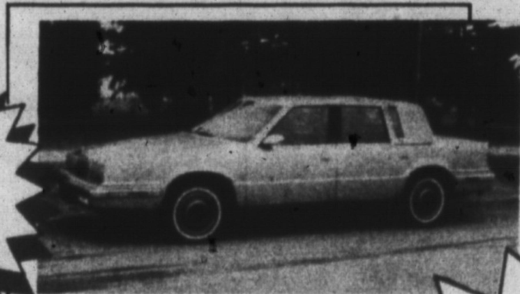
1991 5 TH AVE LOADED!! Blue *19,995