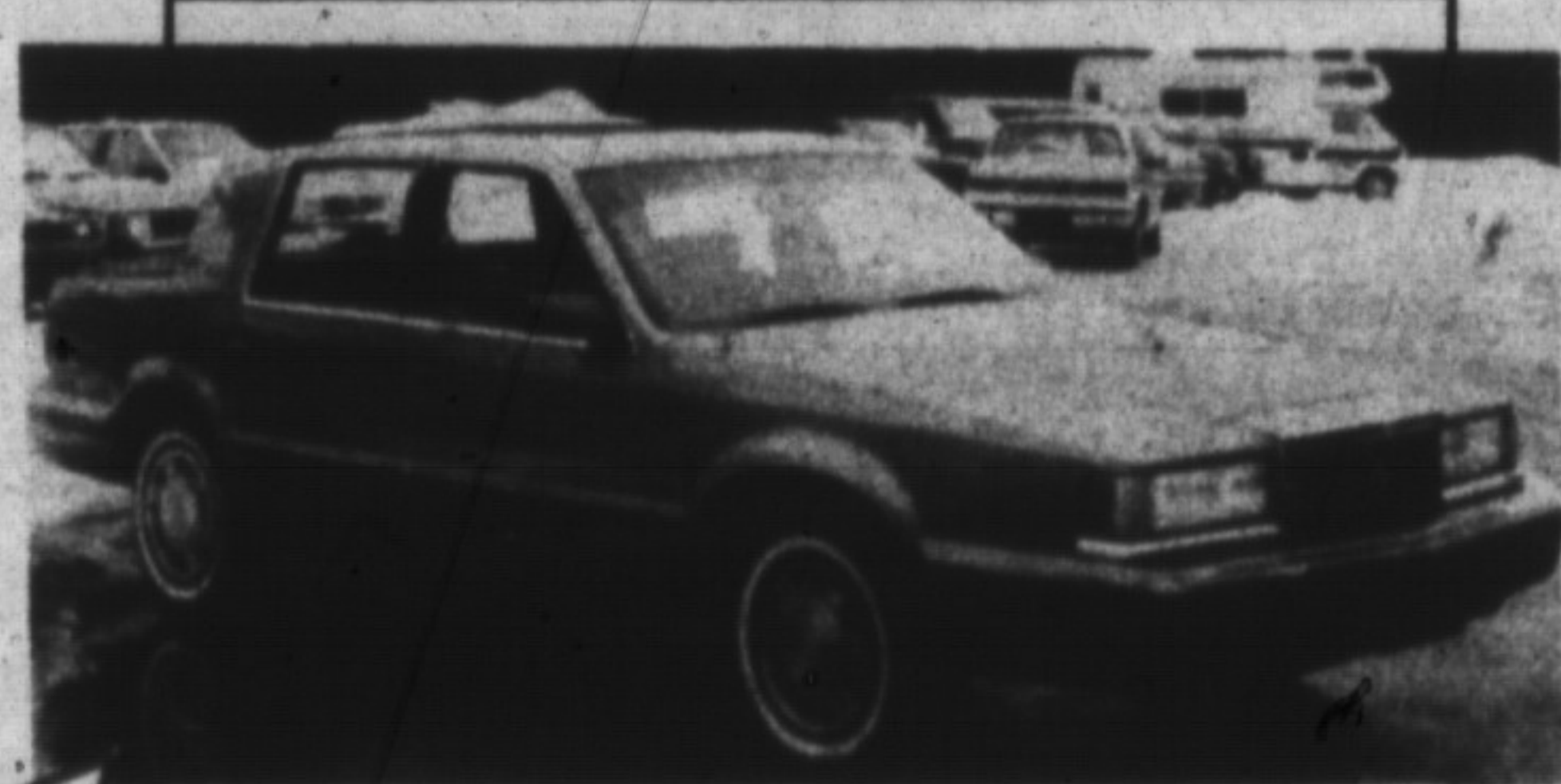
1991 CHRYSLER DYNASTY Air, low kms, grey *13,995

BALANCE OF 7 YEAR OR 115,000 KM POWER TRAIN WARRANTY