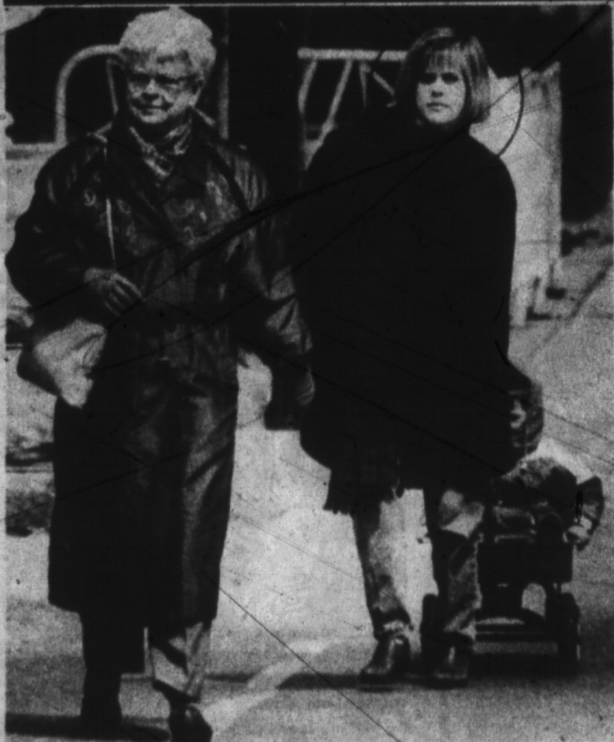
DOWNTOWN SHOPPER Please call 876-2773 to Win!