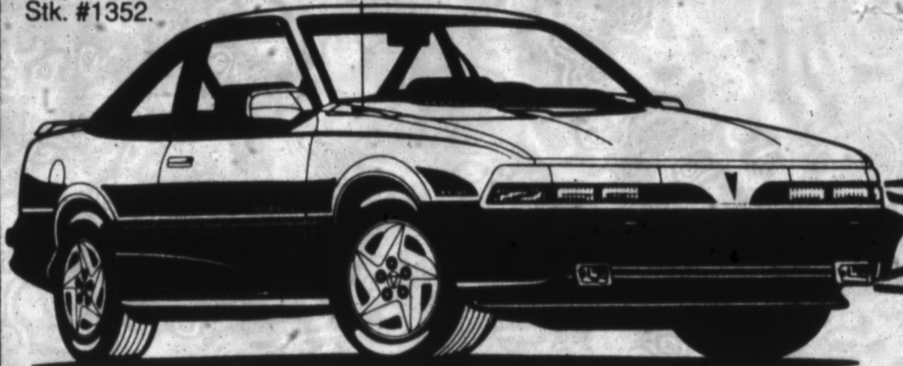
1992 SUNBIRD SE

2 Door Coupe / 3.1 Litre V6 / Air Conditioning / 15" Styled Alum. Wheels / 195-65-15 Tires / AM-FM Stereo Cassette / Power Door Locks. Stk. #1320.