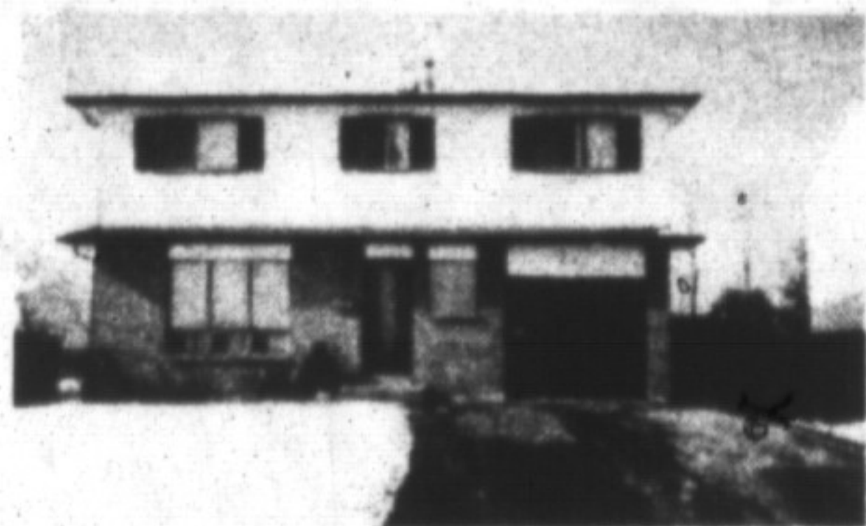
CABOT TRAIL $179,900

This 4 bedroom home has lots of upgrades—3 pce ensuite and a 2 pce on the main floor, as well as a 4 pce bathroom. Family room with fireplace, rec room with wet bar. There are areas of hardwood floors, areas of ceramics and marble. the broadloom too has been upgraded. Outside, the large lot is privacy fenced and contains a vegetable garden and several fruit trees and bushes. Call Audrey for more info at 878-2365 or 878-5339.