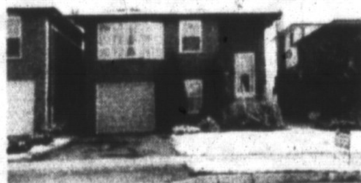
COXE BLVD $192,000

Spotless home in Dorset Park. 4 bedrooms, finished rec. room, well upgraded neutral broadloom, central air. Fenced back yard, open aspect, near schools, store, bus GO transit, tennis courts, etc. Call Audrey for a viewing at 878-2365 or 878-5339