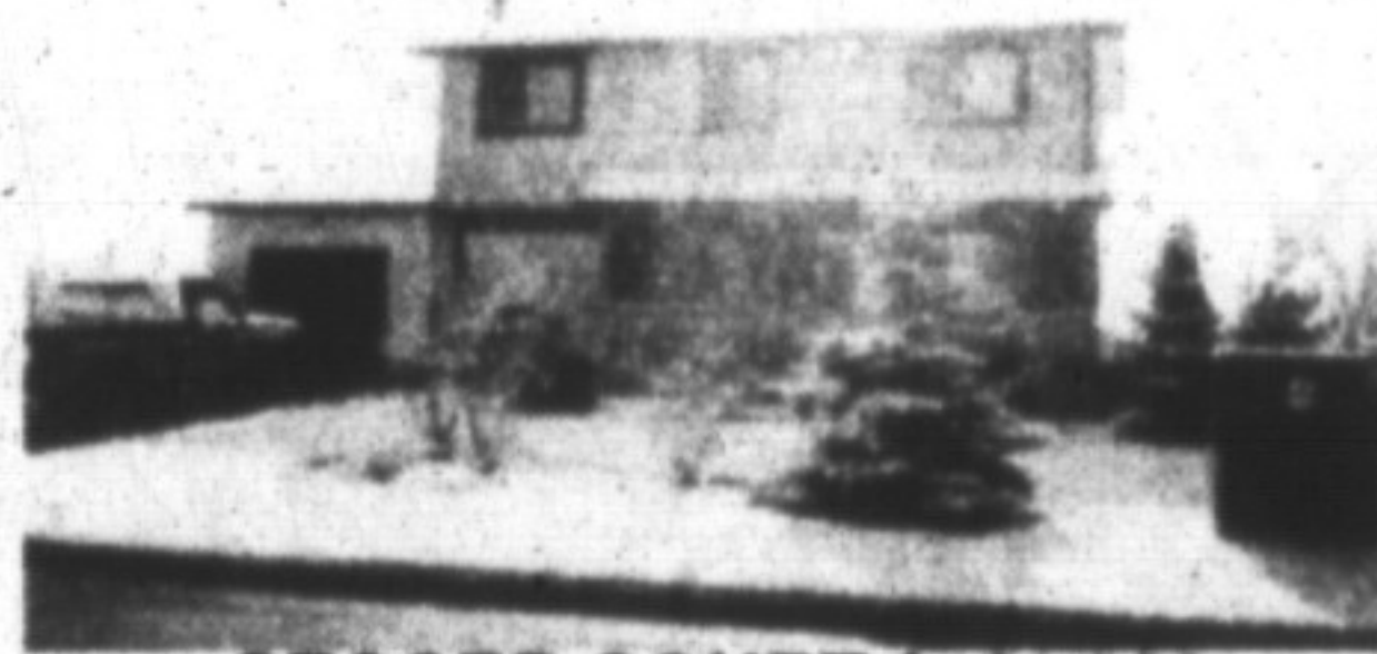
SECORD COURT $181,900

This 4 bedroom home has lots of upgrades—3 pce ensuite and a 2 pce on the main floor, as well as a 4 pce bathroom. Family room with fireplace, rec room with wet bar. There are areas of hardwood floors, areas of ceramics and marble. the broadloom too has been upgraded. Outside, the large lot is privacy fenced and contains a vegetable garden and several fruit trees and bushes. Call Audrey for more info at 878-2365 or 878-5339.