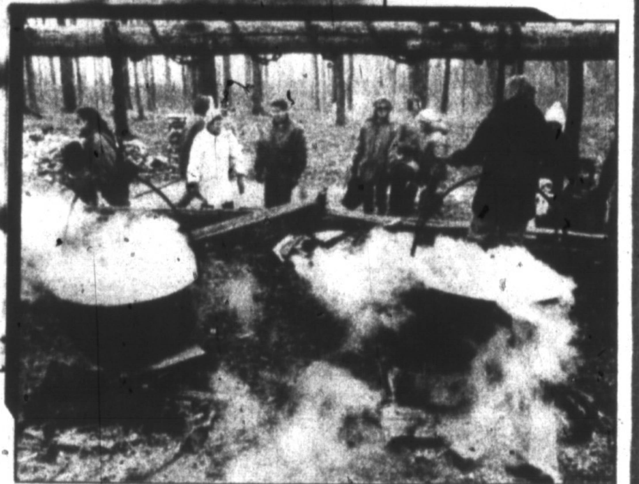
The maple bush at Mountsberg Wildlife Centre is a popular destination this time of year. The maple syrup program continues until April 12 with demonstrations and samples to treat visitors. Ryan Charette (above) samples some hard maple candy available for sale in the bush.