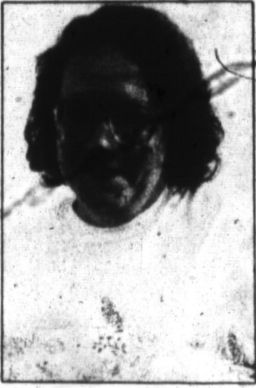
"Of course they will attempt to gain further approvals for more construction. Nothing they can say will convince me otherwise."