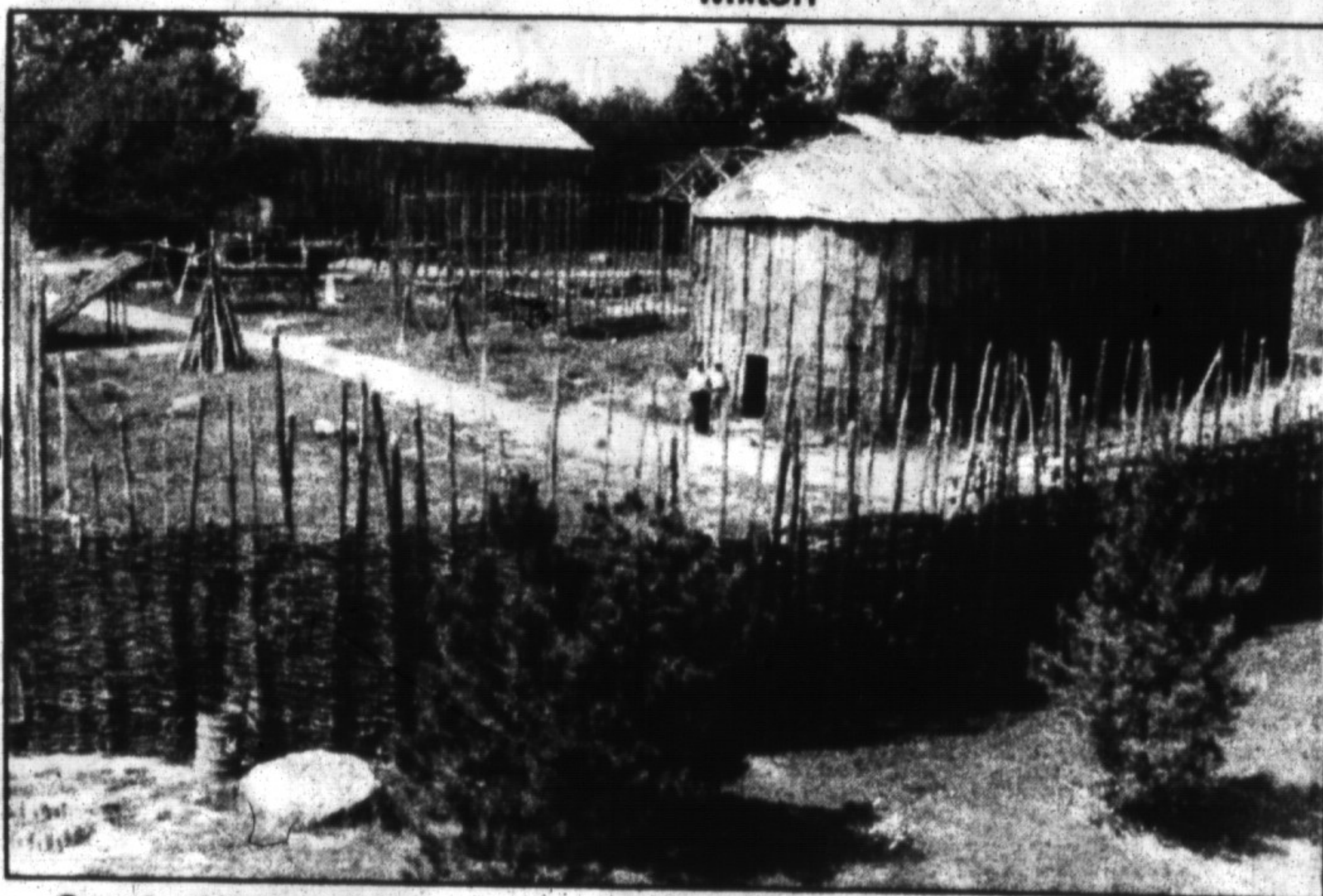
Crawford Lake Indian village attracts tourists and school groups from miles around to Milton.