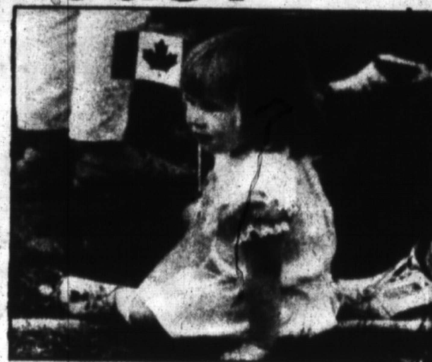
Canada Day is marked by celebrations at Rotary Park.