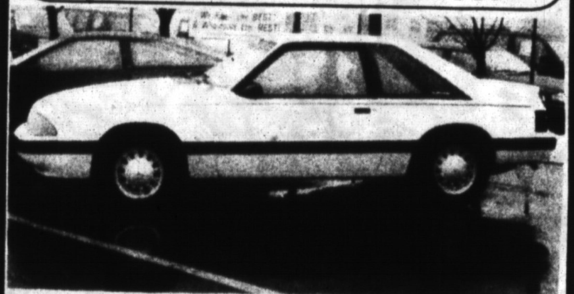
1989 MUSTANG LX HATCHBACK

4 cylinder, automatic, P.S., P.B., P. door locks, A.C., P.W., AM/FM cassette, cruise control, white with grey interior. Only 52,000 km. Balance of Ford Factory Warranty. Expires March 13. Stock # 82A.