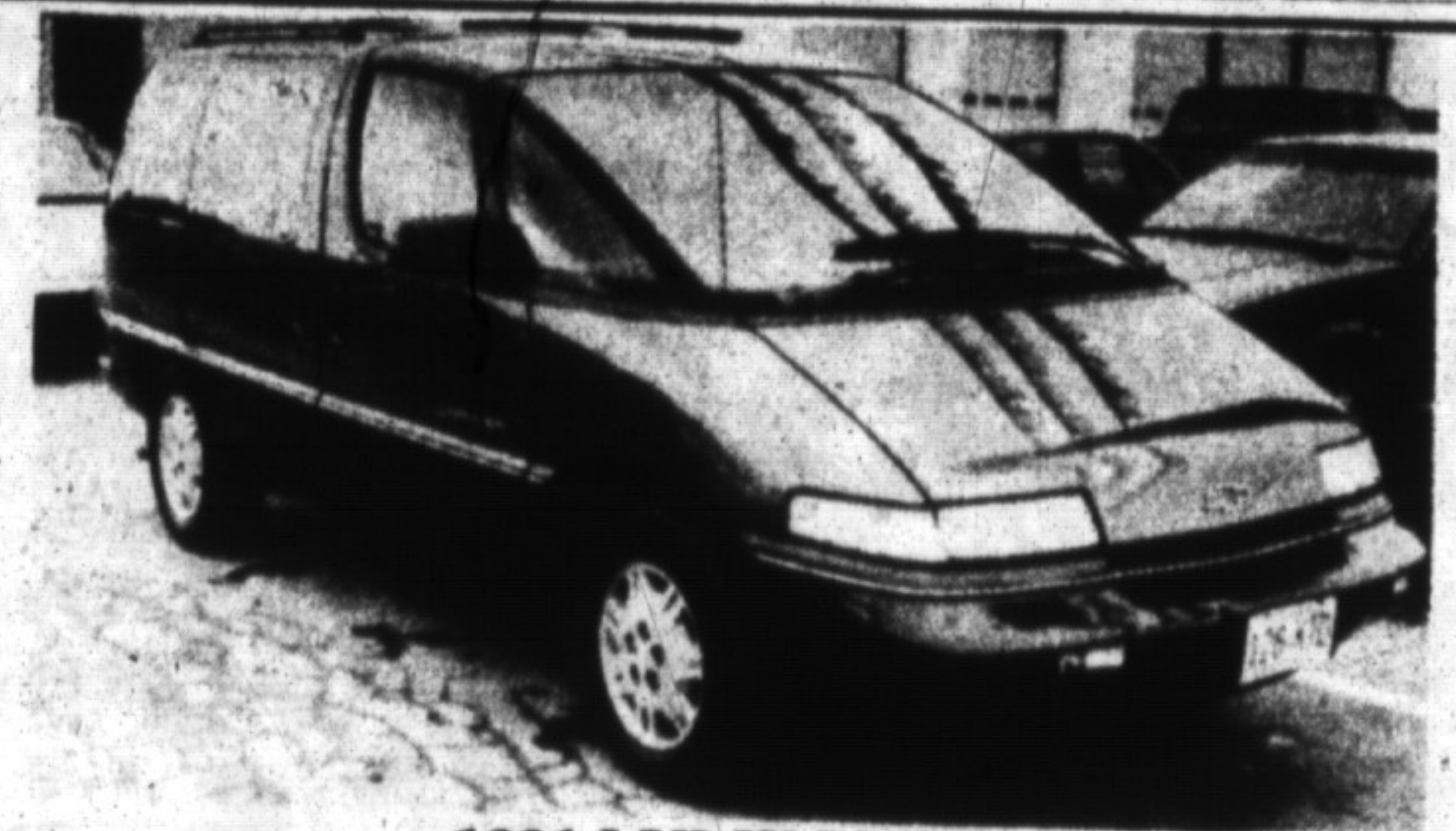
1991 LUMINA APV

Improving your odds against Canada's #1 killer