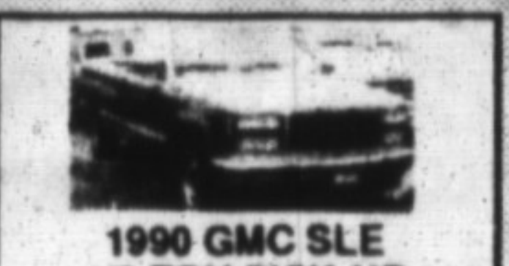
1990 GMC SLE 1/2 TON PICK-UP

Only 43,000 km!! One owner, V8 engine, auto, fully loaded incl. air, PW, PL, delay wipers, AM/FM cassette, box liner & much more, rustproofed, balance of GM total Warranty, top of the line, Stk. #6154.