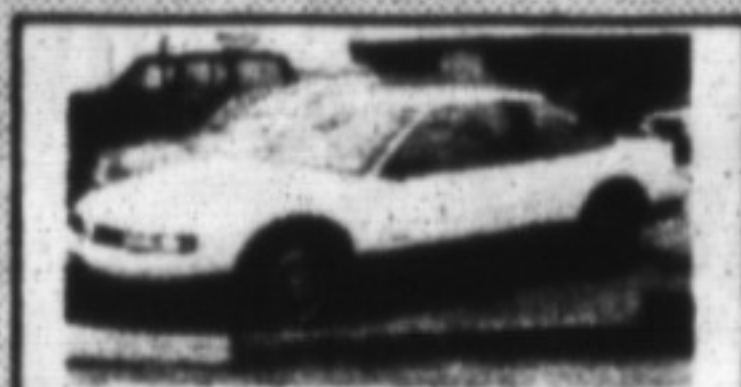
1989 OLDS CUTLASS SUPREME SL

Only 49,000 km!! One owner, V6 engine, fully loaded incl. air, FE-3 suspension, trunk rack & much, much more, balance of GM Total Warranty, Stk #4167.