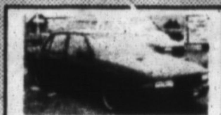
1989 PONTIAC BONNEVILLE SSE

Only 40,000 km!! Every but every conceivable option incl. leather & moonroof, one owner, immaculate, top of the line model, Stk #4926.