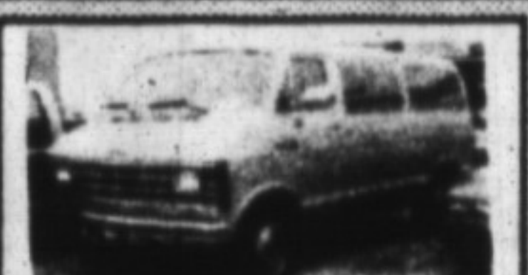
1987 DODGE RAM 350 LE PASSENGER VAN

Only 81,000 km!! Full history available, auto, V6 engine, dual air & heat, 11-passenger, rust-proofed, AM/FM stereo, Stk. #2480.