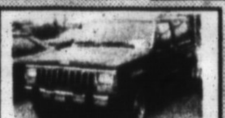
1986 JEEP CHEROKEE 4x4

Only 114,000 km!! V6 engine, auto, air, cruise, tilt, delay wipers, AM/FM cassette, aluminum rims, Stk. #7501.