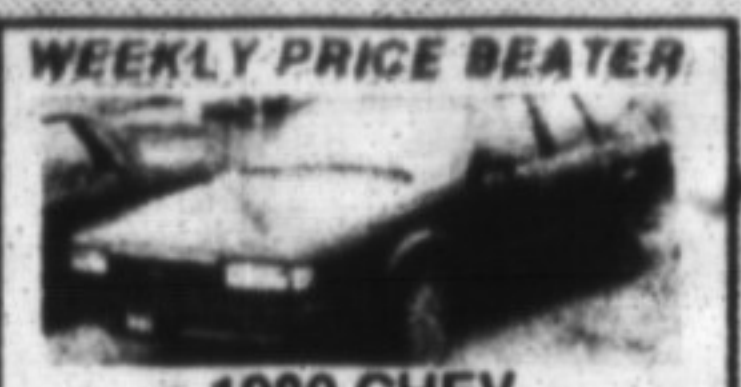
1989 CHEV CELEBRITY WAGON

One owner, V6 engine, auto with overdrive, air, PS, PB, AM/FM stereo, price includes 1-year unlimited mileage power train warranty, 95,000 miles, very clean, Stk. #7953.