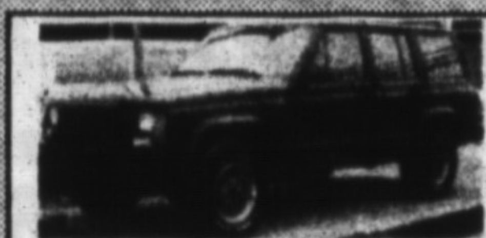
1989 JEEP CHEROKEE LTD. 4x4

Only 33,000 km!! One owner, every option available incl. leather, sunroof, power seats, air and much more, top of the line, balance of Chrysler warranty. Stk. #4411