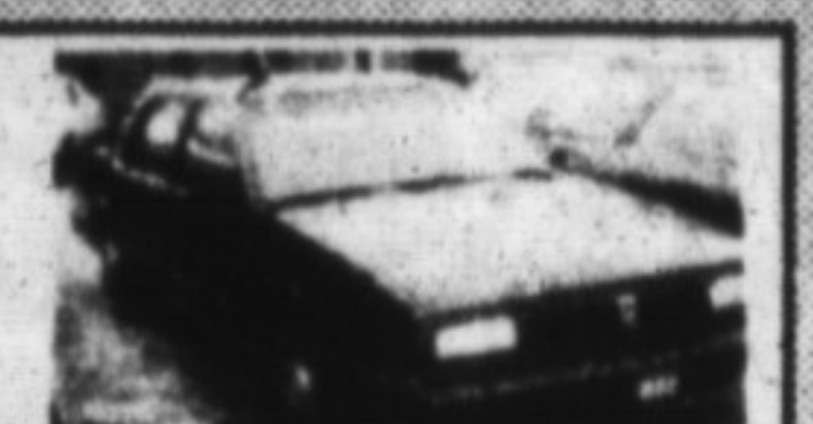
1988 PONTIAC 6000 4 Door

Only 76,000 km!! One owner, V6 engine, air, cruise, tilt, delay wipers, AM/FM cassette, warranty, Stk #8037.