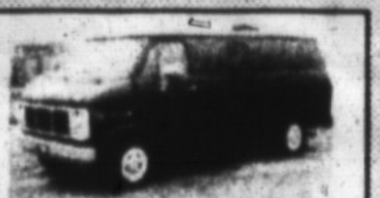
1989 GMC VANDURA 1/2 TON CARGO VAN

Side barn doors!! Only 75,000 km, one owner, V8 engine, auto, PS, PB, AM/FM stereo, side window, blue, balance of GM Total Warranty, Stk. 0003.