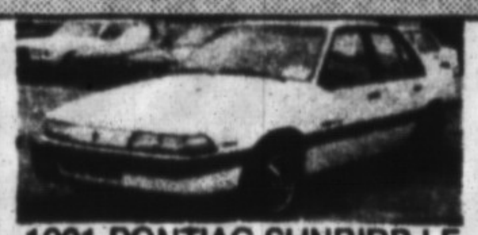
1991 PONTIAC SUNBIRD LE 4 Door

Only 13,000 km!! One owner, talk to original owner. V6 Engine!! auto, air, cruise, tilt, delay wipers, PW, PL, PT, AM-FM, Cassette, aluminum rims & much more, balance of GM Total warranty, Stk. #4779.