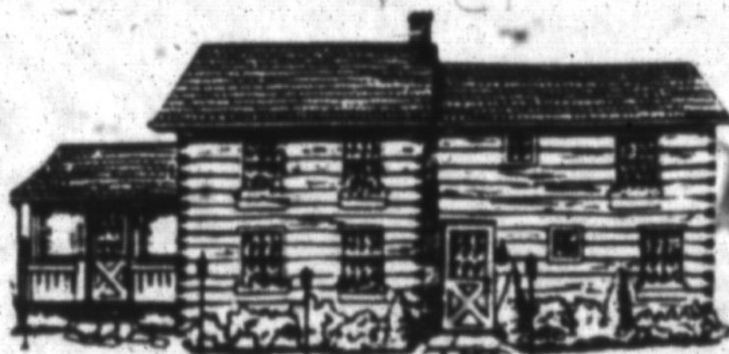
Log House, Campbellville