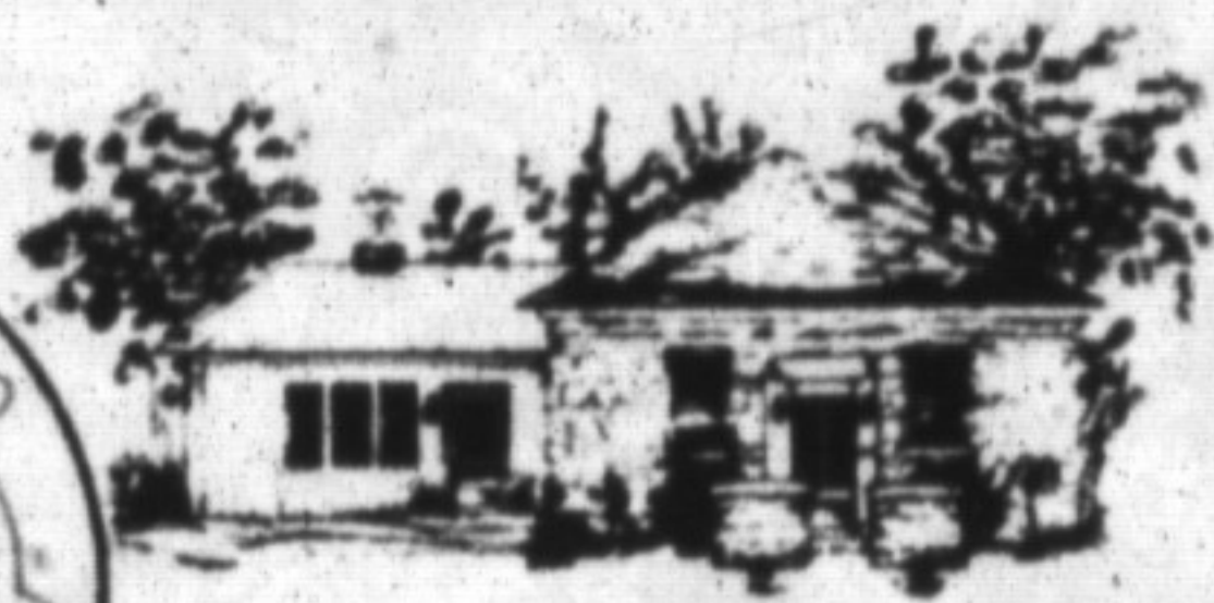
Collectibles Tea Room

Visit our country cottage and take a piece of its charm home to treasure!