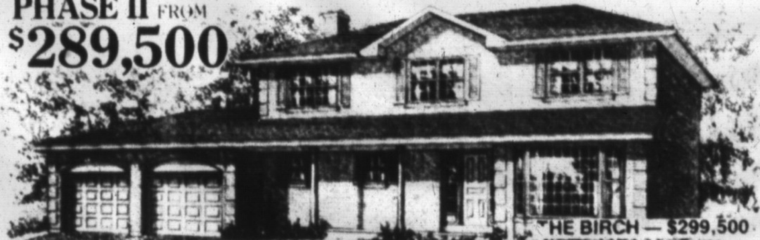
THE BIRCH — $299,500