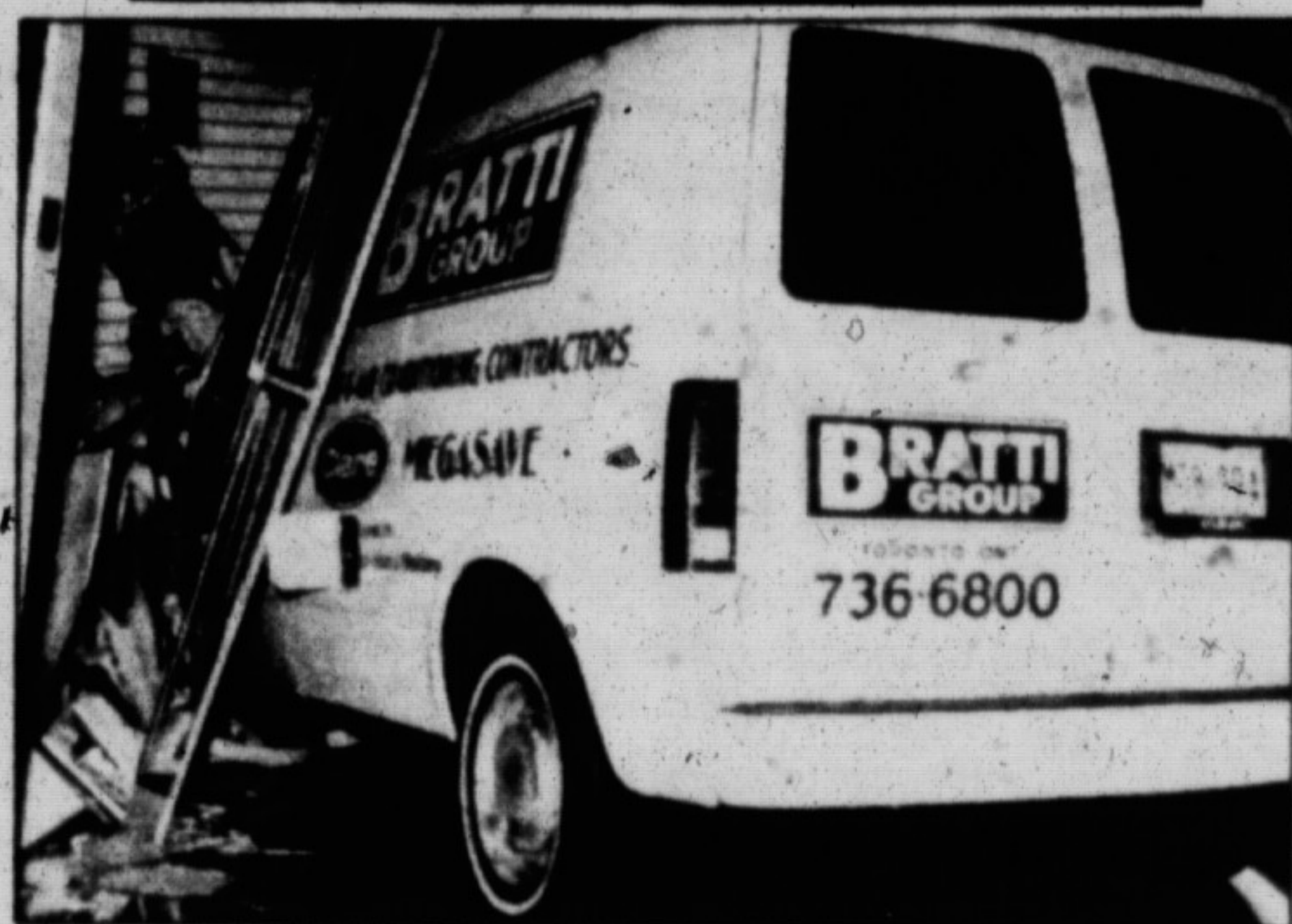
Damage estimate was set at $500,000 after this GMC van was sent through the back entrance to Milton Mall and crashed into two stores.