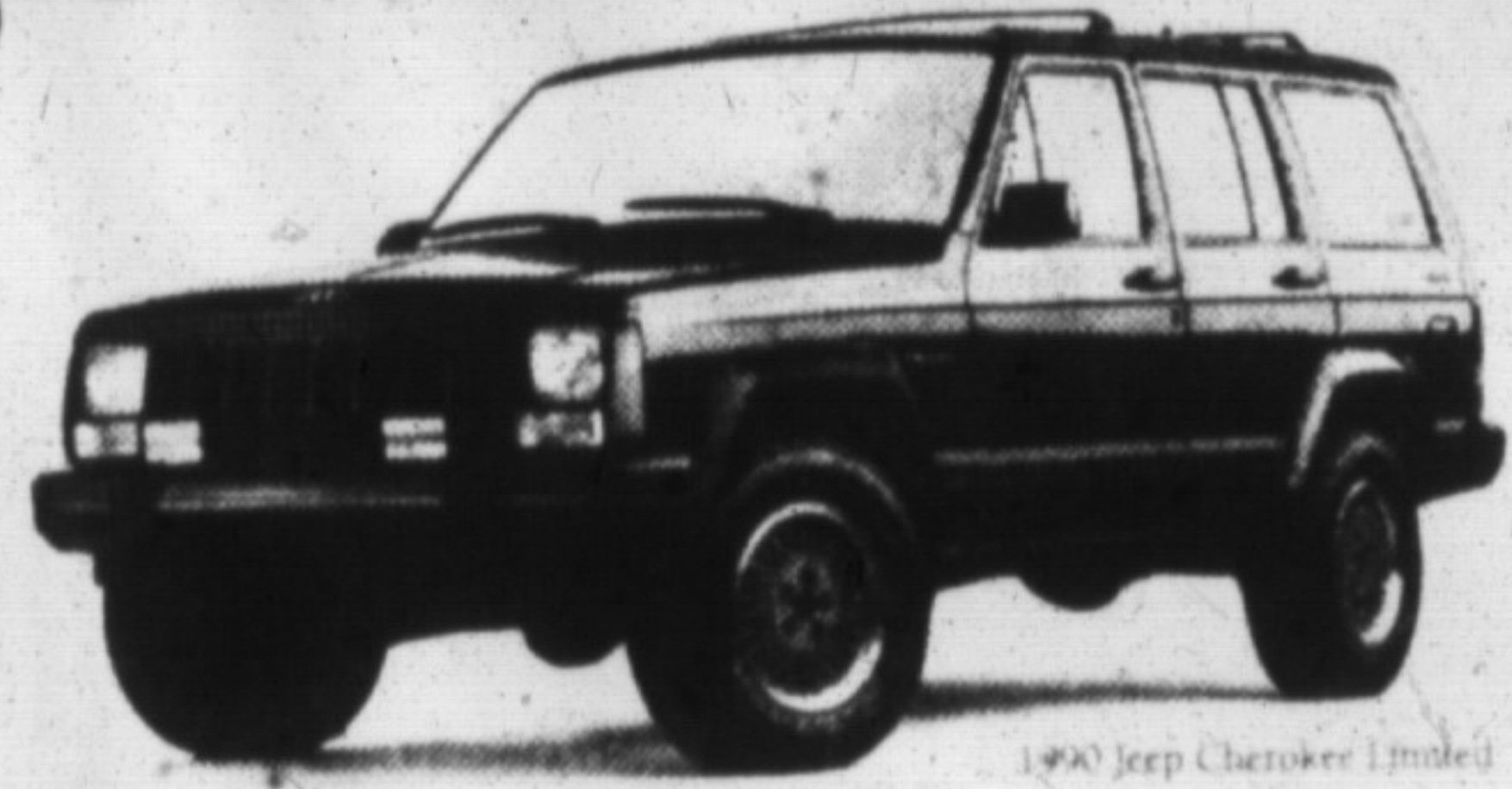
1990 Jeep Cherokee Limited

Now's the time to get into an Eagle price leader with $350 GST savings* plus low financing or up to $750 cashback**