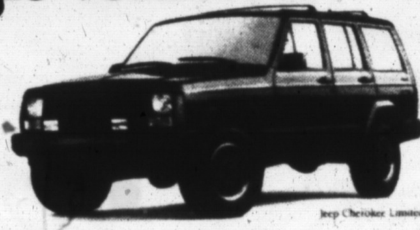
Jeep Cherokee Limited

Now's the time to get into an Eagle price leader with $350 GST savings plus low financing or $750 cashback.