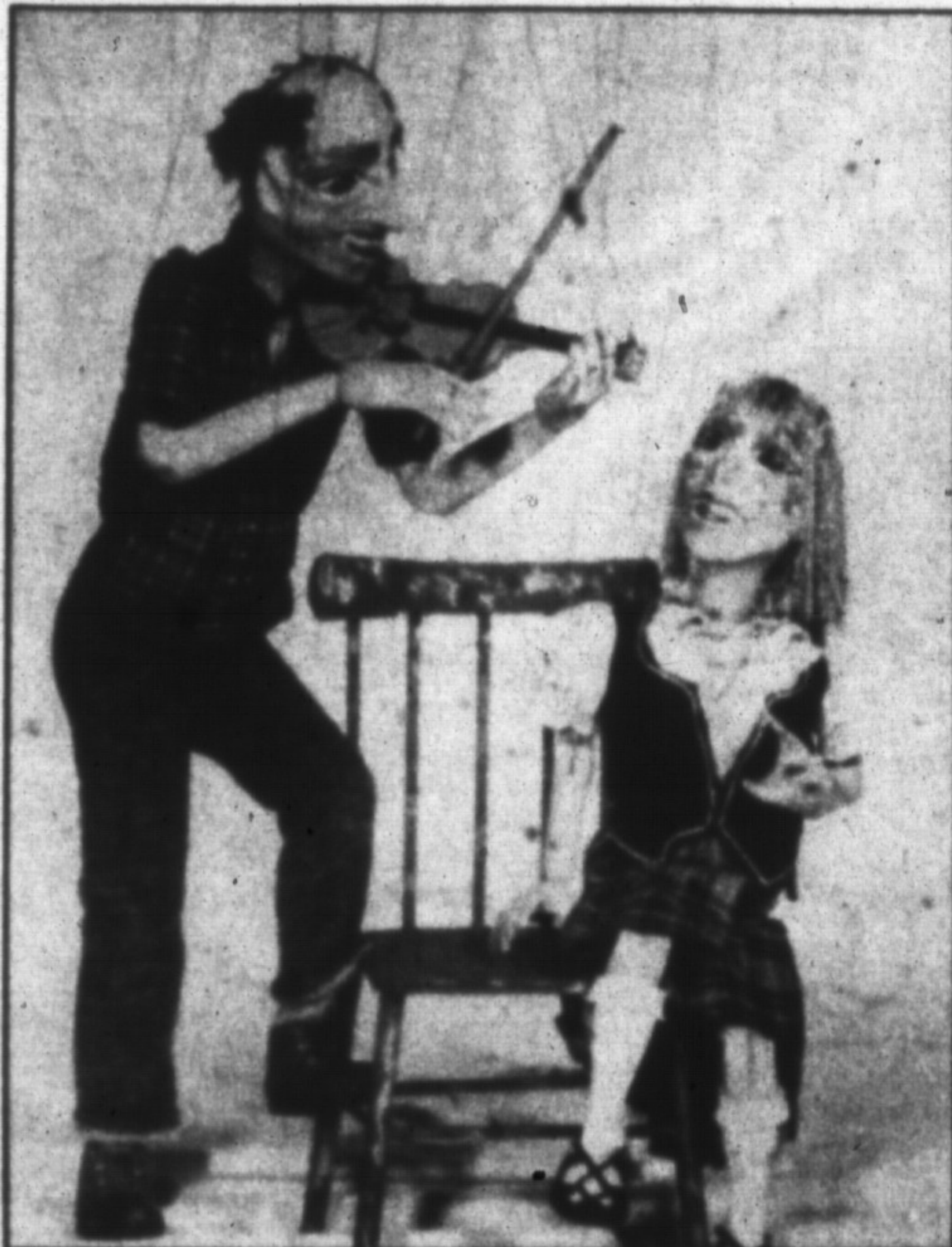
The Maritime Marionettes will perform The Greatest Little Show at the Optimist Centre Sunday, Oct. 14.

They can be purchased at the CHERISH Parent-Child Centre in the Optimist Centre, the Paper Factory or Halton Community Credit Union, both on Main Street.