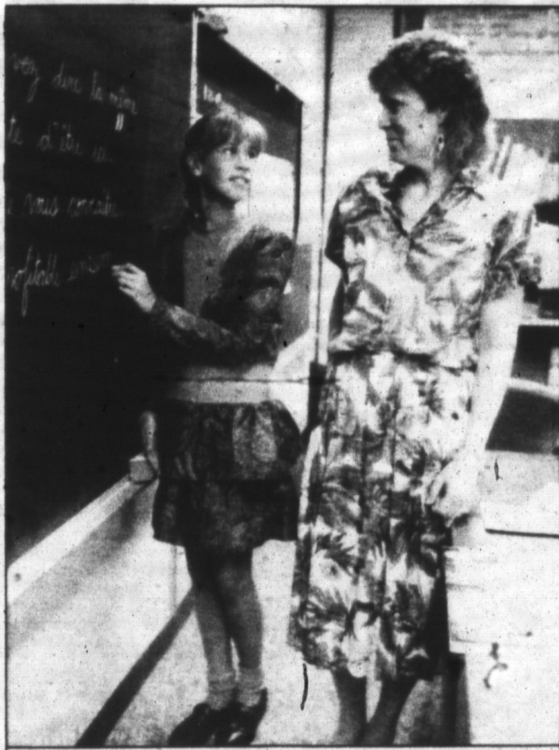
The Canadian Champion, Friday, September 21, 1990