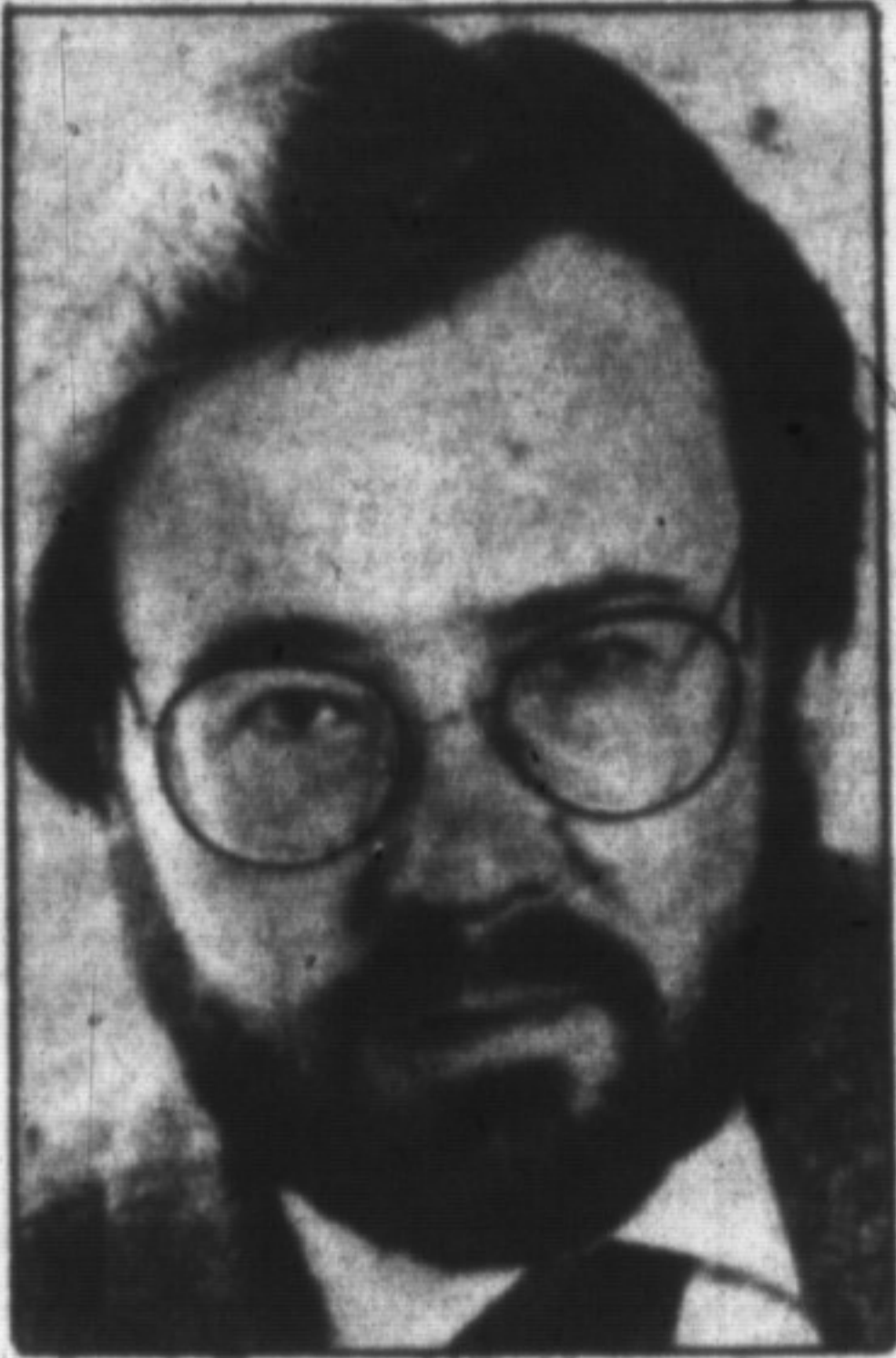
Garth Turner, MP, Halton-Peel

None of these are currently government policy, he said, "but maybe that can change."