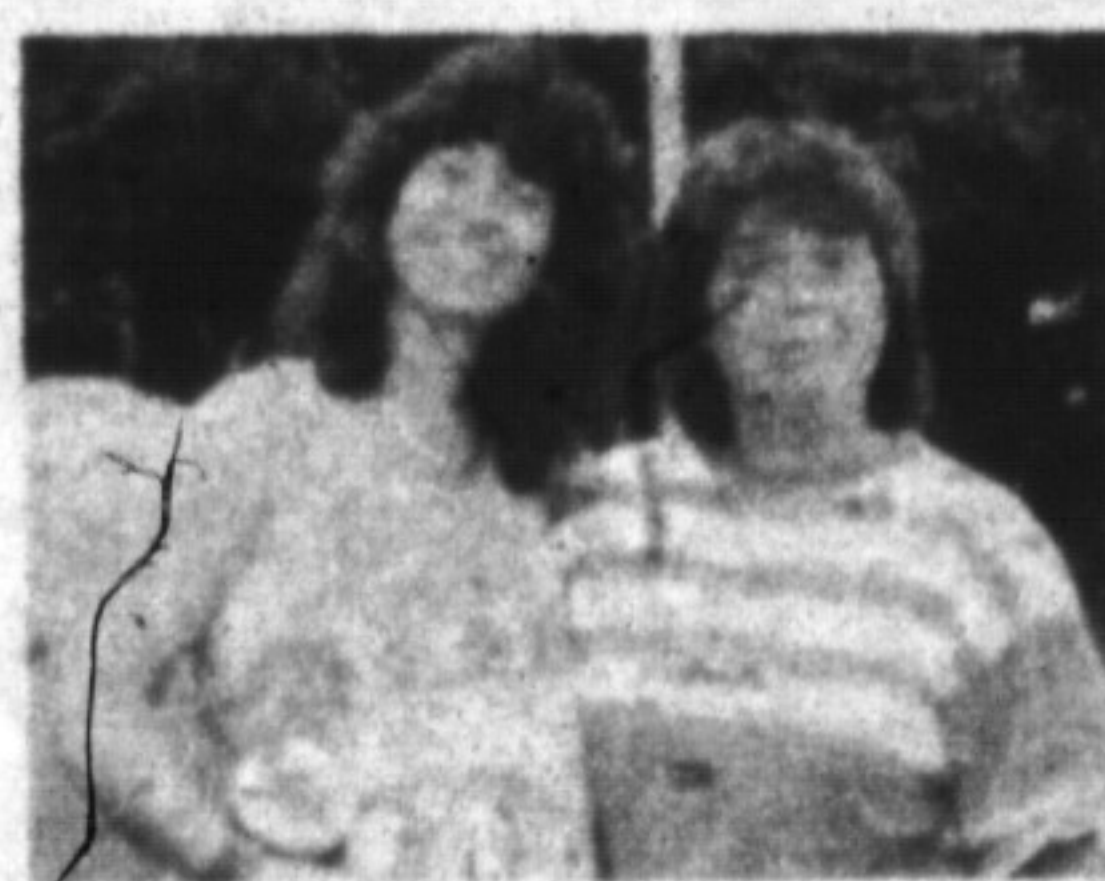
27 and Holding!