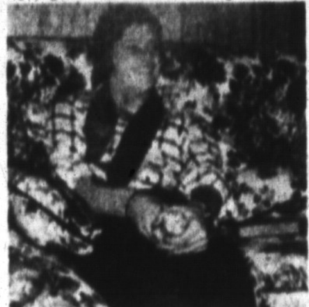
(p.s. I invented birthdays!)