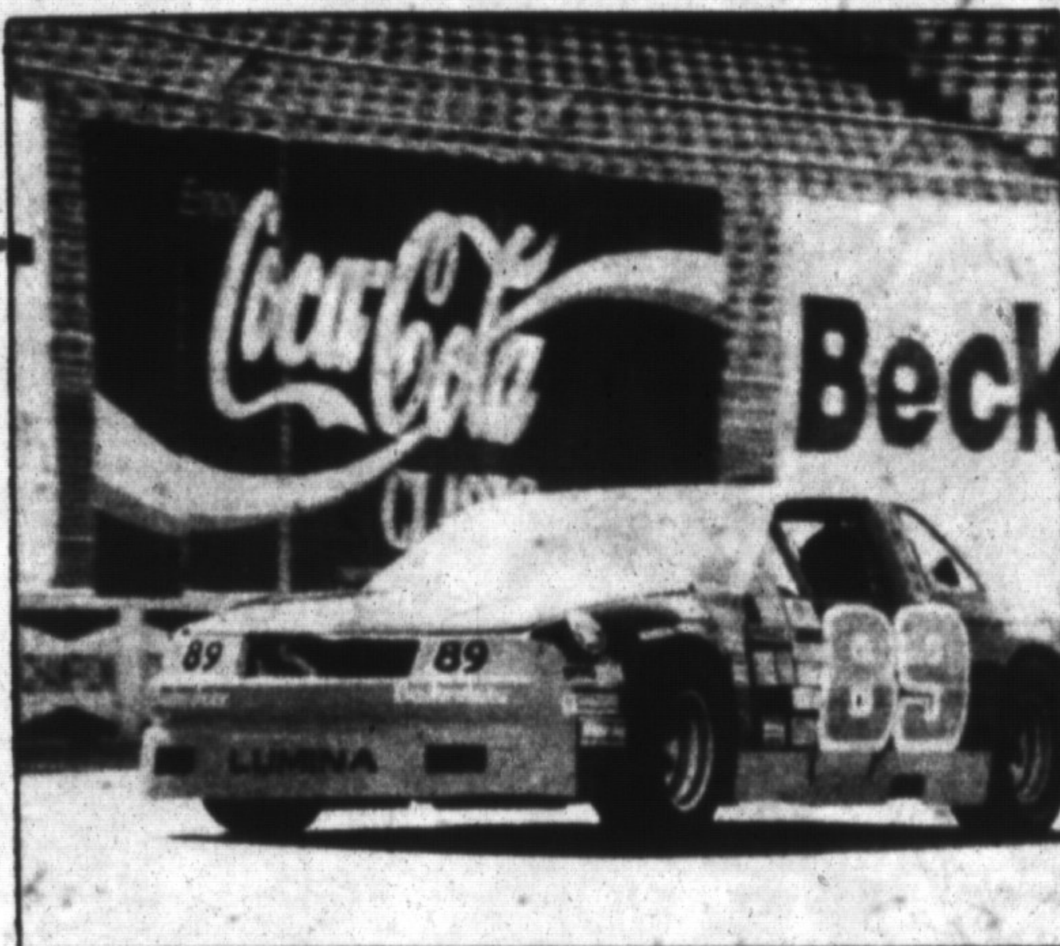
Budweiser stocks run every Thursday night at Exhibition stadium through the first week in October. Hobby cars and Midgets run Sundays. Action starts at 1:30 p.m.

In the summer of 1948 a new grandstand used only for Canadian National Exhibition events was opened. It was designed by the architectural