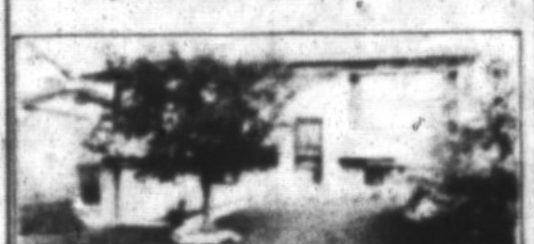
DORSET PARK AREA

$287,500 - Beautifully kept family home - Gleaming hardwood entry & kitchen - Prof. landscaped yard - Rec. room with wet bar & fridge Don't delay call Ian or Marilyn Wykes, 842-1920.