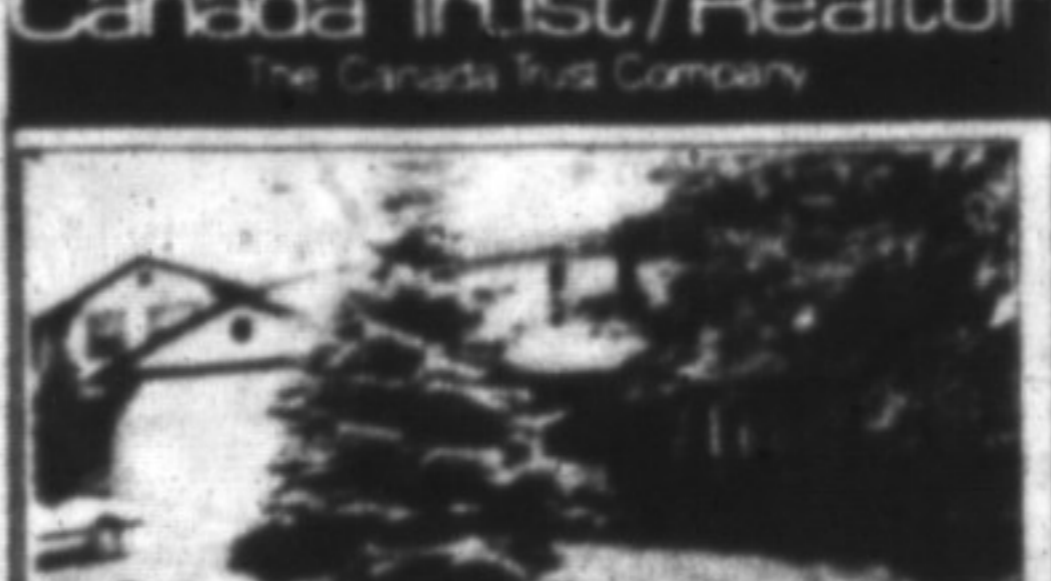
"JUST PACK YOUR BAGS"

Canada Trust/Realtor The Canada Trust Company