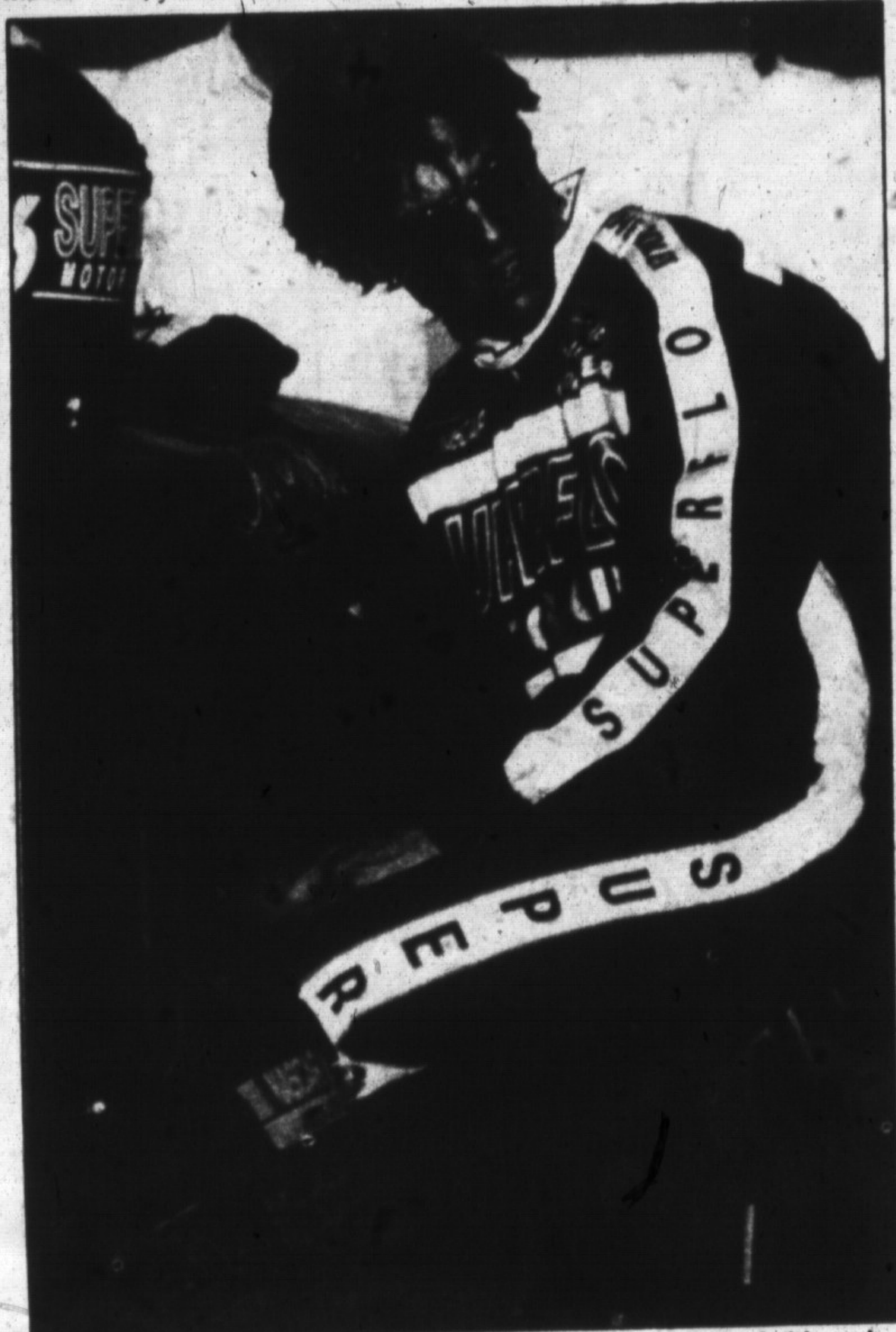
Tom Cruise takes on a familiar role in his new movie, and although it has been panned by some critics, his legions of fans don't care.