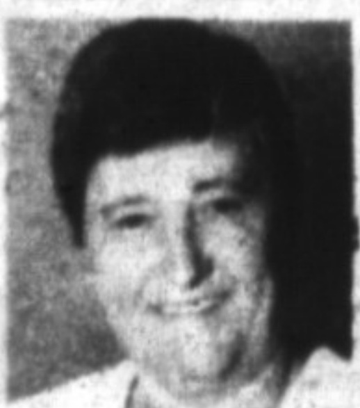
JOSEPHINE PERIC* 878-7849

Be captivated by the gracious sun flooded rooms of this elegant two storey residence. A location that says your the who's who in town. With all it's fabulous features this home features this home defines lifestyle. For your exclusive viewing call Wayne Casson. $349,900. MO-89