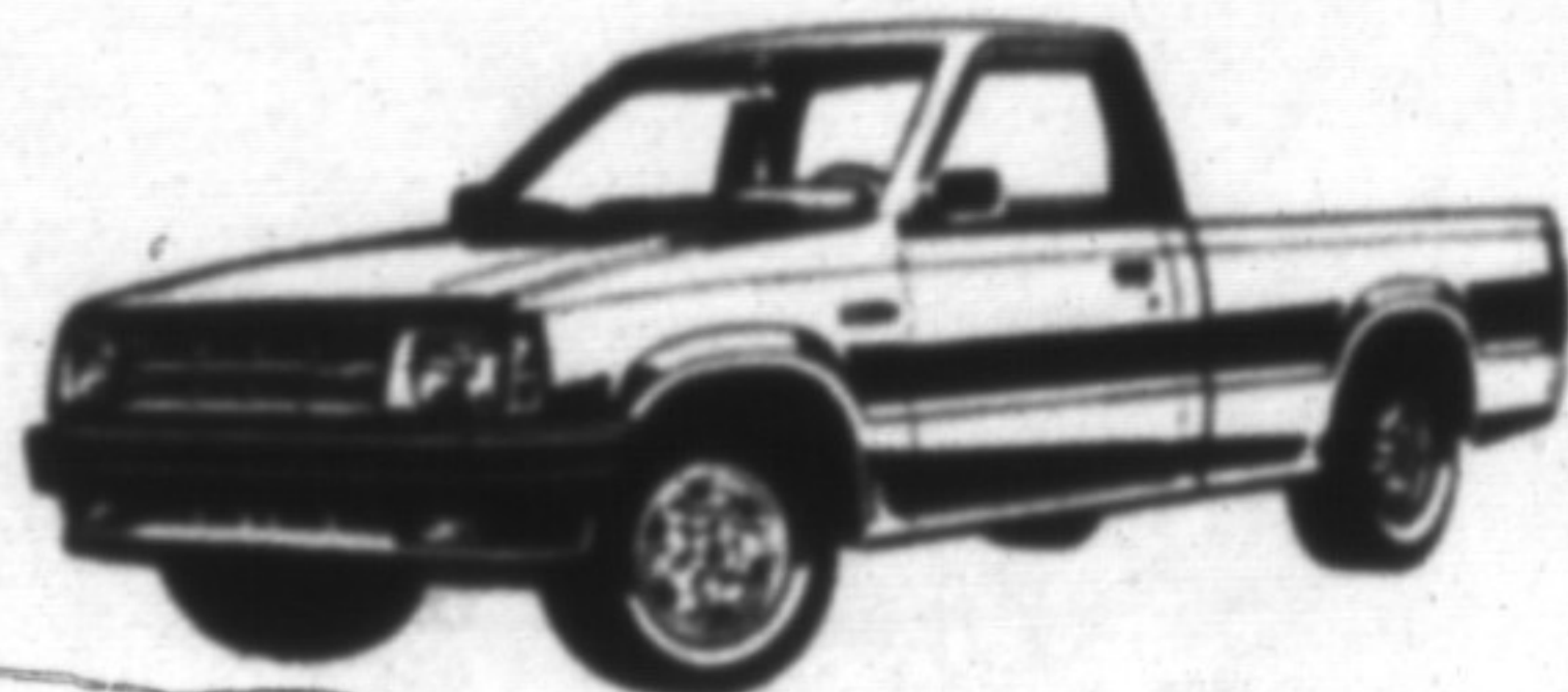
P6B2 1990 MAZDA TRUCK

Price includes all Mazda Rebates and cannot be combined with any other offer plus Tax, Licence, Freight & P.D.I.